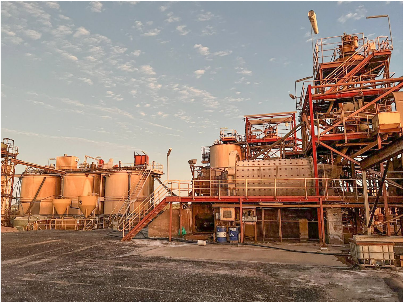
Image 1 - The Lorena Processing Facility

The acquisition terms were negotiated to allow us to utilise our existing cash reserves and cash flow to fund the acquisition from near term gold production, which limits dilution and delivers a highly positive result for shareholders. This is another important step in delivering on our aspiration to become a meaningful Australian gold producer as we fast track to near term gold production from Lorena in Q4, 2022."