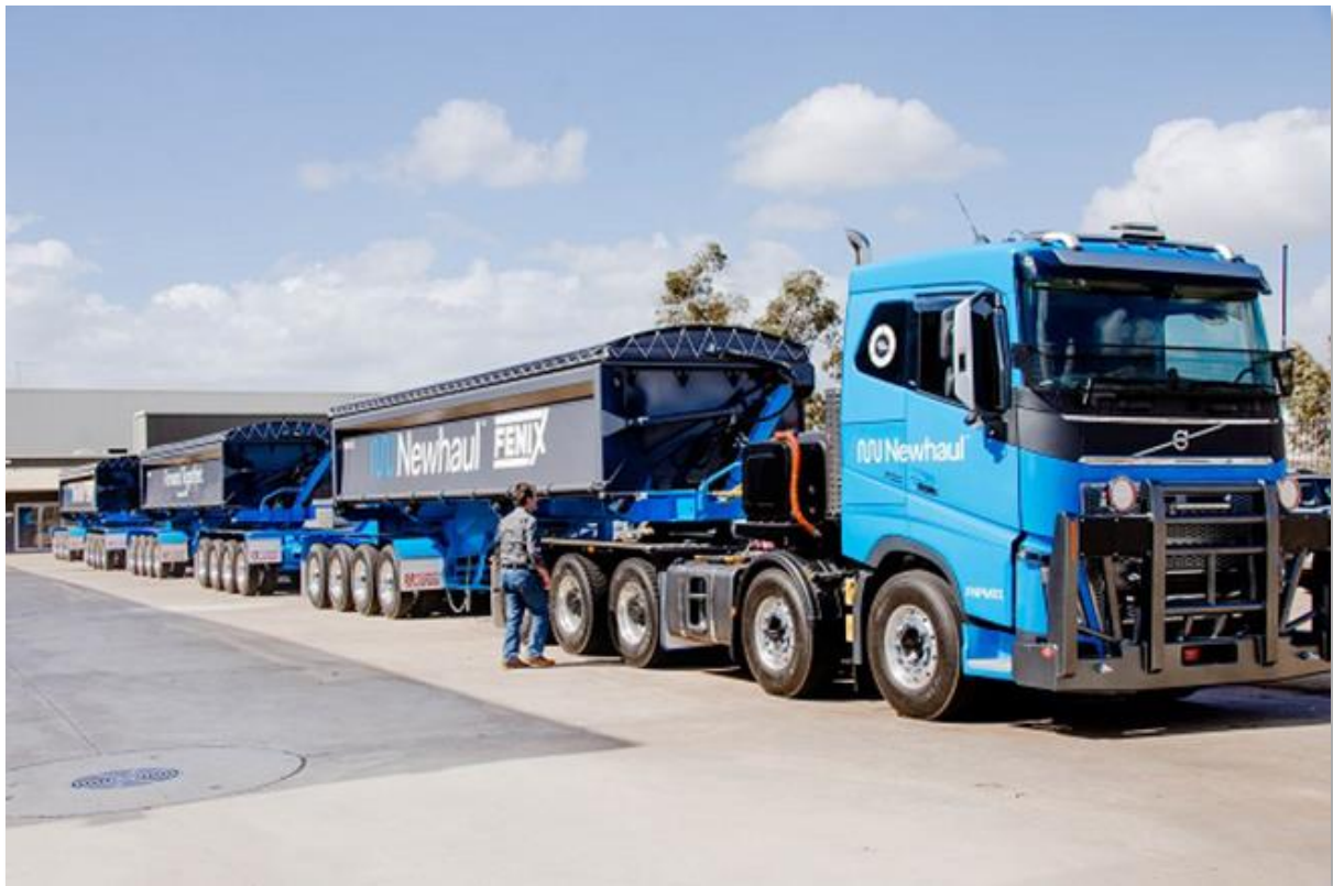
Fenix-Newhaul Prime Mover and Trailer Combination