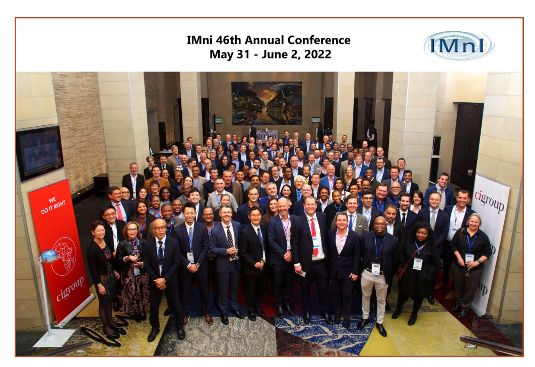
Figure 3: Jupiter Board and Executives attend the International Manganese Institute Conference in Cape Town.