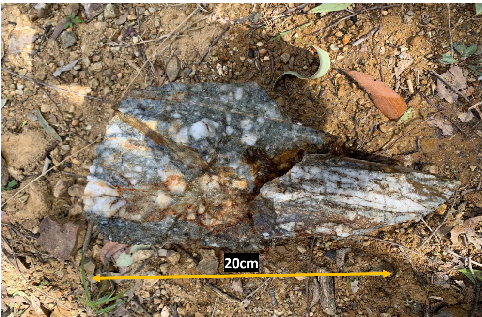
Image 1: Jackadgerly – Quartz breccia John Bull gold shaft waste dump – Assays pending.

The Jackadgerly Gold Project is located between Glen Innes and Grafton in northern New South Wales within the New England Orogen (Figure 1). A track mounted RC rig has been selected to leave a minimal environmental footprint. All drill sites for this maiden drilling campaign have been designed to test the historic John Bull Gold shafts (1880’s), the main gold sluiced area (1940’s) and the historic surface trench (1980’s by Kennecott Exploration (Australia) and Southern Goldfields Ltd) that contains an untested mineralised interval of 160m @ 1.2 g/t Au.