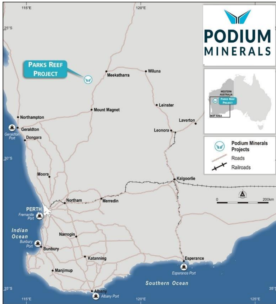
Figure 1. Location of the Parks Reef PGM project 80km West of Meekatharra in Western Australia.

Podium is targeting high value metals with strong market fundamentals and growth prospects with a strategy to rapidly develop an alternative supply of PGMs to the world market.