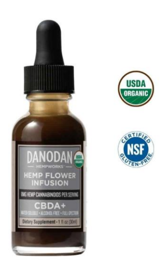
Danodan's new CBDA+ product

As the effects of the Covid pandemic have begun to abate, engagement with key retailers has led to improved availability in MOM's Organic Market and New Seasons, with a new CBDA+ product being launched online. Fiji Kava has engaged with leading natural, organic and specialty retail broker, Grass Roots Marketing, to cover the Pacific Northwest and California regions to expand the Company's distribution of Danodan products within the growing number of retailers accepting ingestible CBD products.