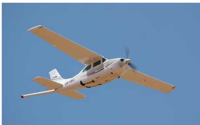
Figure 1: Example Airborne Survey Aircraft

Regener8 has awarded the airborne geophysical survey contract for an aeromagnetic and radiometric survey over the Kookynie Gold Project – Niagara West and Niagara North tenements to MAGSPEC Airborne Surveys. Together with previous surveys, this survey will ensure a complete, high resolution airborne geophysical dataset is created across all the Project's tenements. The survey is anticipated to be undertaken over the coming weeks, subject to weather conditions and other factors.