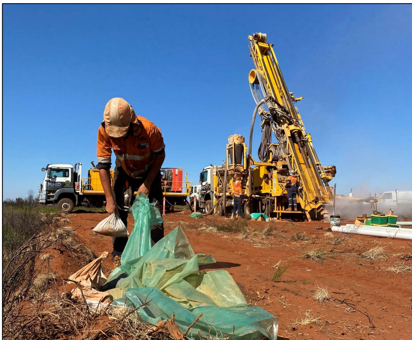
Figure 1: RC drilling at Yule Target 2, July 22.

Gold, lithium, and base metals exploration company Golden State Mining Limited (ASX code: “GSM” or the “Company”) is pleased to announce that reverse circulation (‘RC’) drilling has commenced over Target 2A at the Yule Project in the Pilbara, Western Australia.