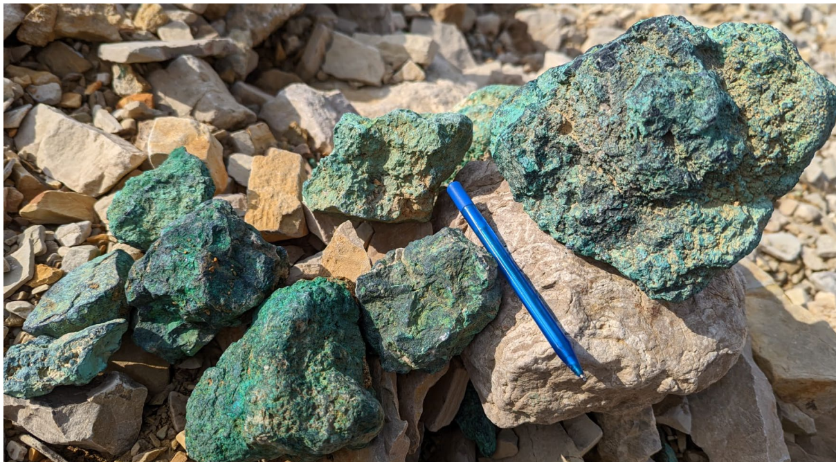
Figure 1: Outcropping massive chalcocite (copper sulphide) at the 2750N Zone, where drilling is in progress.