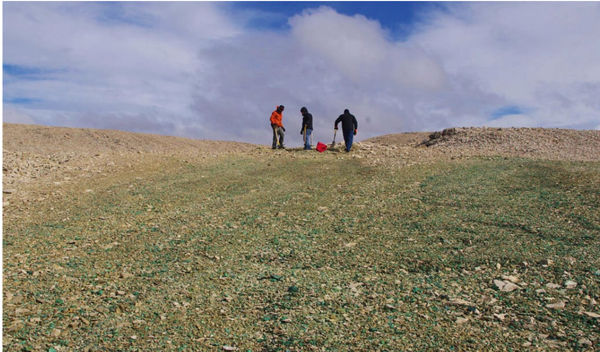
Figure 4: Photo of the Storm project area – the blanket of turquoise hues at surface indicates outcropping copper from the high-grade primary mineralisation lying underneath.

Investors can expect regular updates on the drilling and exploration activities.