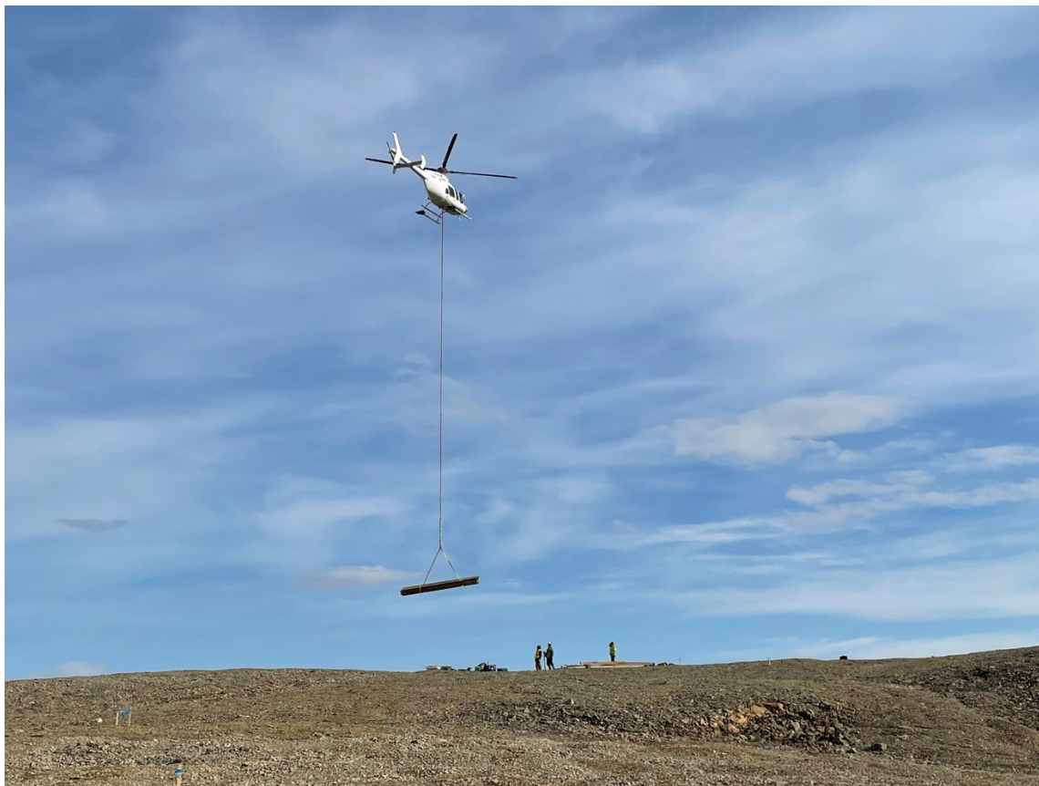
Figure 2: Storm Copper Project – Drill rods being delivered to drill hole ST22-01, 2750N Zone

"The start-up of the program has gone smoothly with favourable weather conditions. We look forward to reporting on the results as drilling progresses."