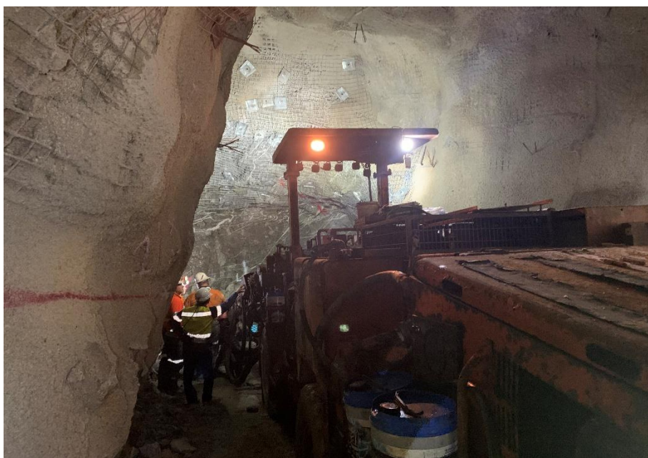
Miners inspecting the high grade Sovereign Reef at the A1 Mine

These results follow previous stand out drilling results from earlier in this program including A1UDH-472: 4.6m @ 135.7 g/t gold from 36m (ASX - 2 May 2022), A1UDH-476: 1.92m @ 43.2 g/t gold from 3.2m and A1UDH-477: 1.2m @ 127.7 g/t gold from 3m (ASX – 5 July 2022).