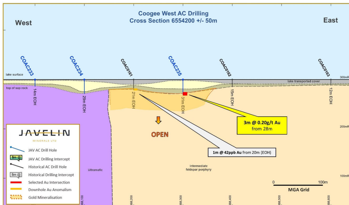
Figure 2: Coogee West AC drill section 6554200N