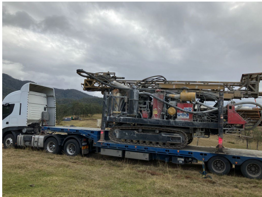
Image 1: Jackadgery – Track mounted RC rig arrives at Jackadgery mining area.

The Jackadgery Gold Project is located between Glen Innes and Grafton in northern New South Wales within the New England Orogen (Figure 1). A track mounted reverse circulation (RC) drill rig (Image 1) has arrived and commenced drilling. All drill sites for this maiden drilling campaign have been designed to test the historic John Bull gold shafts (1880’s), the main gold sluiced area (1940’s) and the historic surface trench (1980’s by Kennecott Exploration (Australia) and Southern Goldfields Ltd) that contains an untested mineralised interval of 160m @ 1.2 g/t Au.