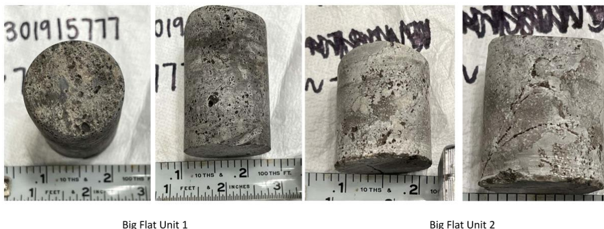
Figure 3: Pictures of Diamond Core from wells that sampled the Mississippian Units.

Recently discovered Diamond core shows fracturing & "vugs" throughout the limestone and dolomite units demonstrating the high porosity required for the storage of brine, see Figure 3. This confirms the geophysical logs and porosity calculation (See ASX announcement 17 June, 2019).