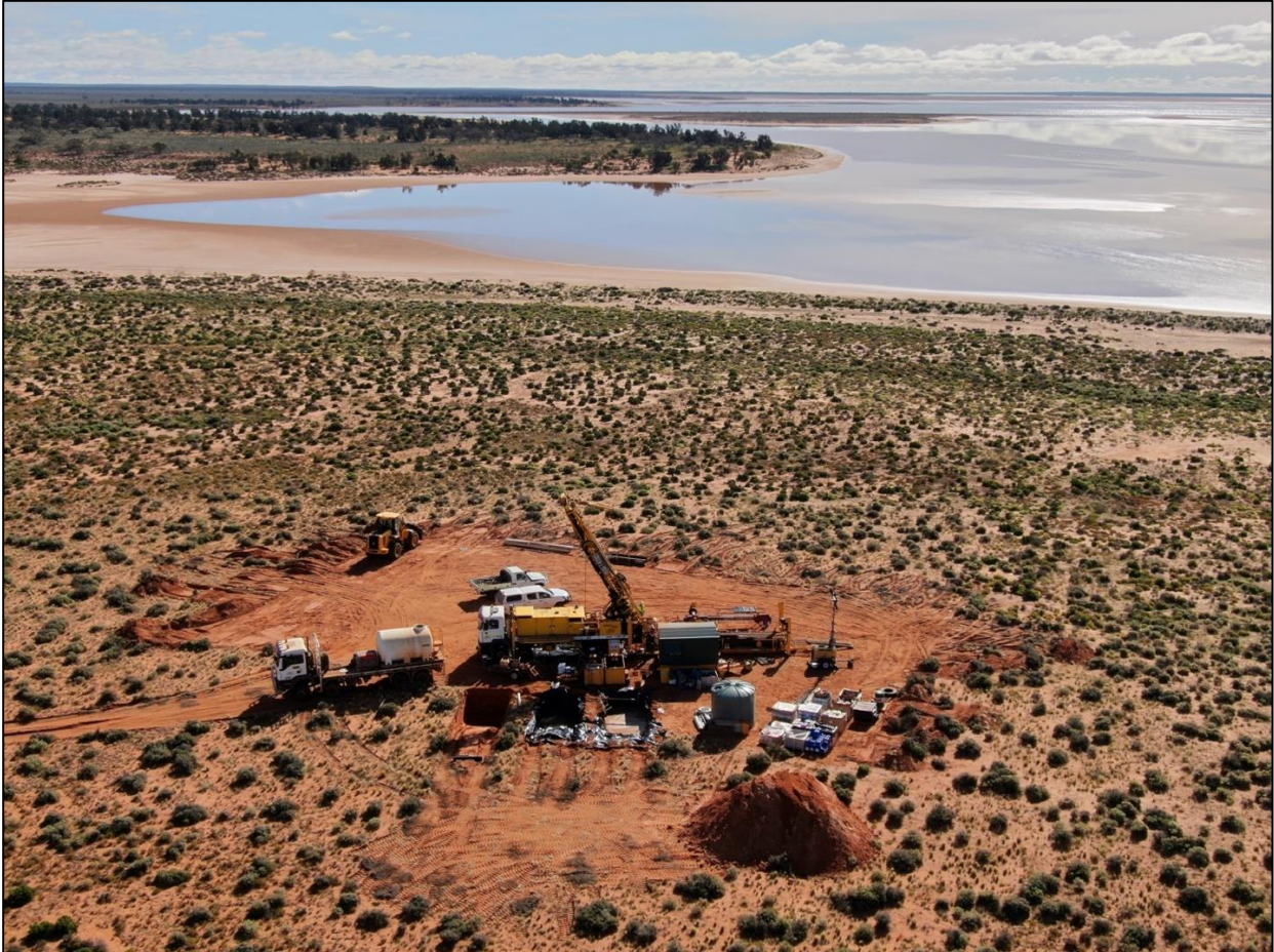
Figure 2: Titeline Drilling's Rig 7 at Evelyn Dam (13 June 2022) looking north with the drill pad of EVE001 in the backdrop on the other side of the bay.

Stelar contracted Titeline Drilling Pty Ltd to drill EVE002. PQ core was drilled from surface to 121.9m depth at -60 dip projecting under Lake MacFarlane. Rotary mud drilling was pushed down to 329.8m depth but resulted in the hole moving \sim 15^\circ off azimuth and dropping \sim 6^\circ . HQ3 core drilling was pushed down to 792.3m. To correct the hole's direction, navi-drilling was undertaken to 856.6m depth which successfully reorientated hole back towards the target zone. NQ2 core is currently being drilled with the hole depth \sim 1,100 m depth.