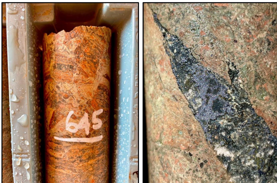
Figure 3: Examples of EVE002 Core: Brecciated rhyolite at 654m (left) and sulphide mineralised vein at 642m (right)