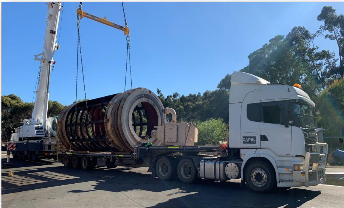
Figure 2: The trommel barrel is loaded for transport

The trommel is a key piece of process equipment, comprising a rotating screening barrel mounted over a large sump on a structural steel-base frame. Mined sand passes through the screen panels and is pumped to the processing plant. The trommel is in excellent condition structurally and an ideal fit-for-purpose item of major process equipment for the project.