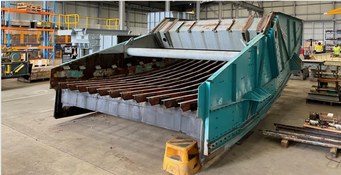
Figure 3: Schenck screen being refurbished at RCR

The screen had undergone strip, non-destructive testing and assessment by the OEM (Original Equipment Manufacturer) and refurbishment is completed.