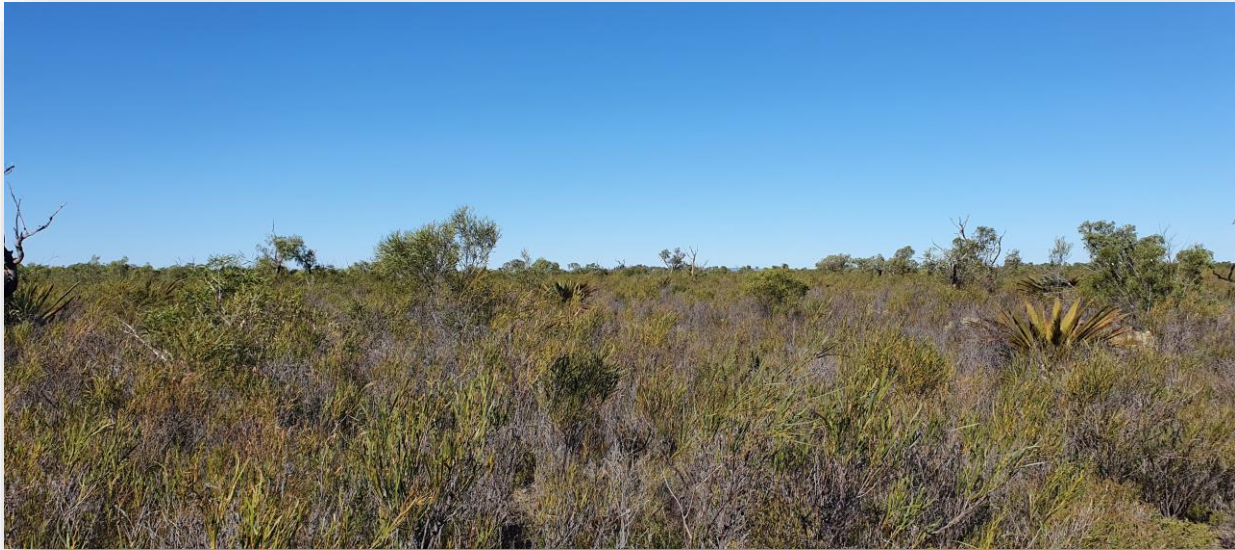
Figure 5: Arrowsmith Central Vegetation

The Arrowsmith Central mining development area has been selected to avoid environmentally sensitive areas, in particular, so that no large trees suitable for Carnaby Cockatoo roosting or nesting are impacted.