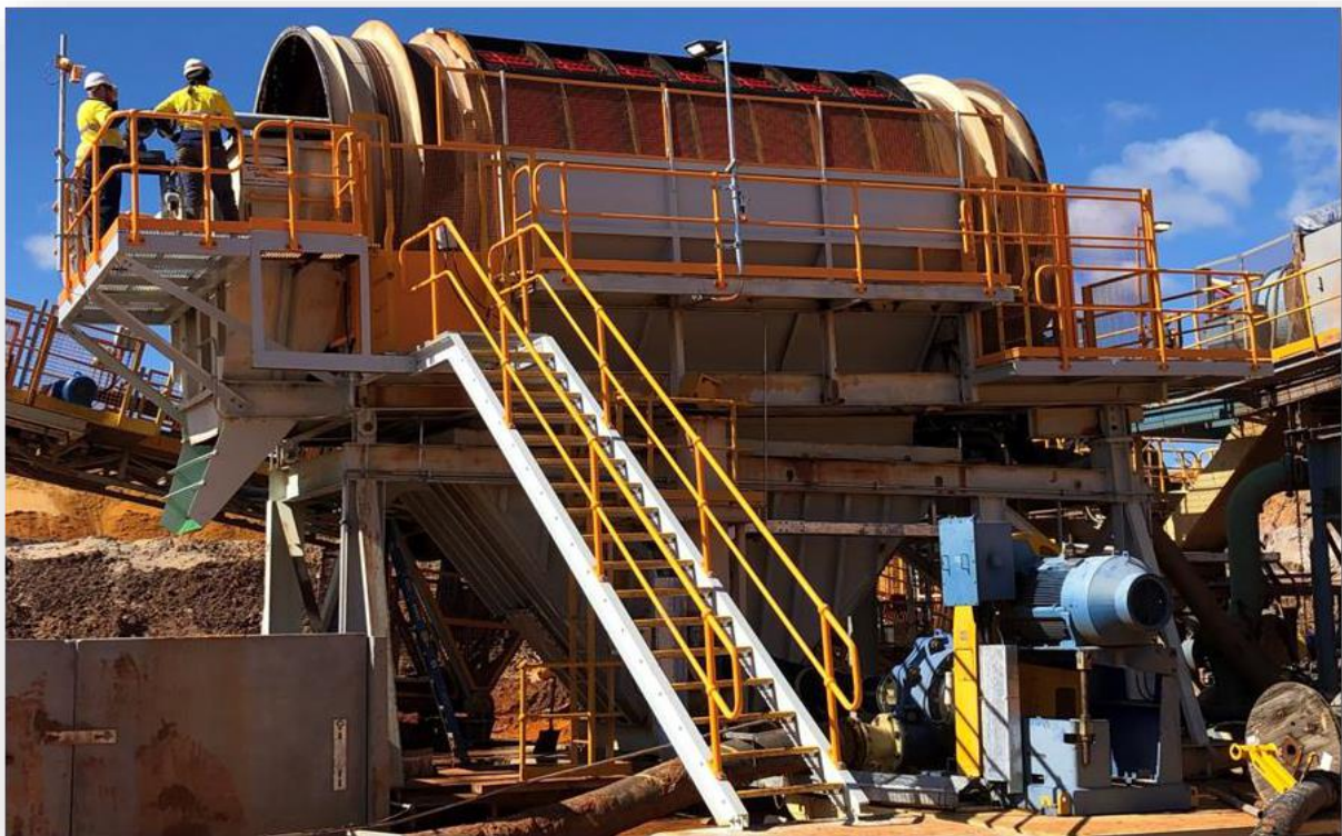
Figure 1: Feed trommel

With the support of specialist engineering consultancy ProjX, VRX purchased locally a 3m diameter x 8m long RCR-designed feed trommel and a 3.6 x 8.5m Schenck “banana” vibrating screen.