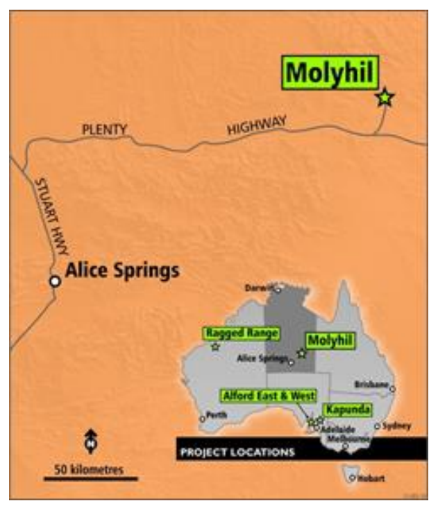
Figure 3: Tenement & Prospect Location Plan