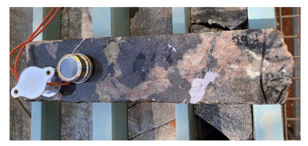
Photo 2: 21MHDD002: 293-294m (293.8m) - 1m @ 0.03% WO<sub>3</sub>, 0.04% Mo and 0.06% Cu – significant visible molybdenite and chalcopyrite visible throughout intercept, contrasting to assays