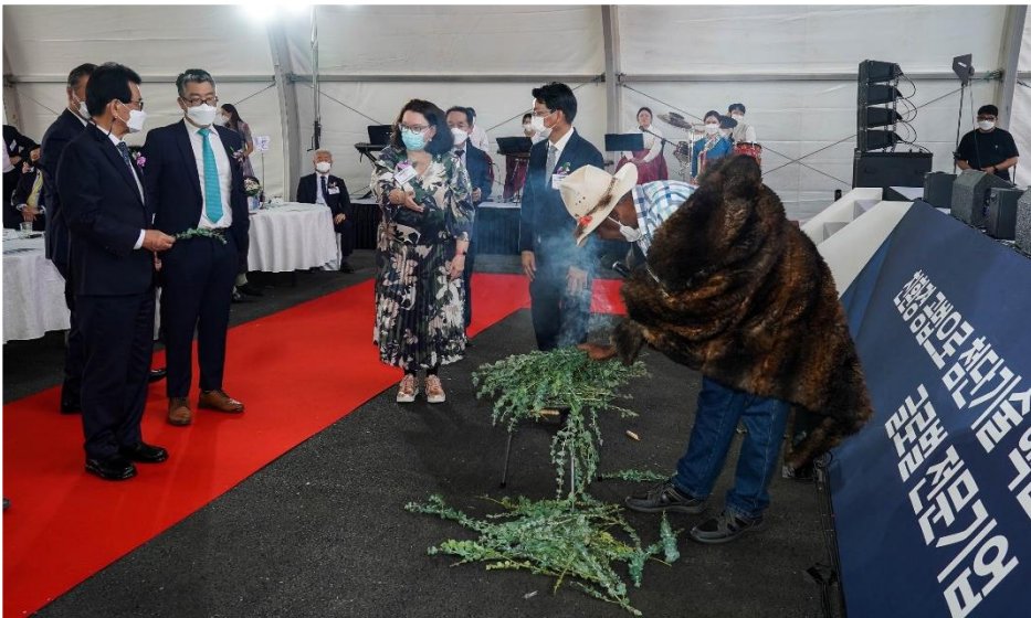
VIPs participate in smoking ceremony - official opening of the Korean Metals Plant