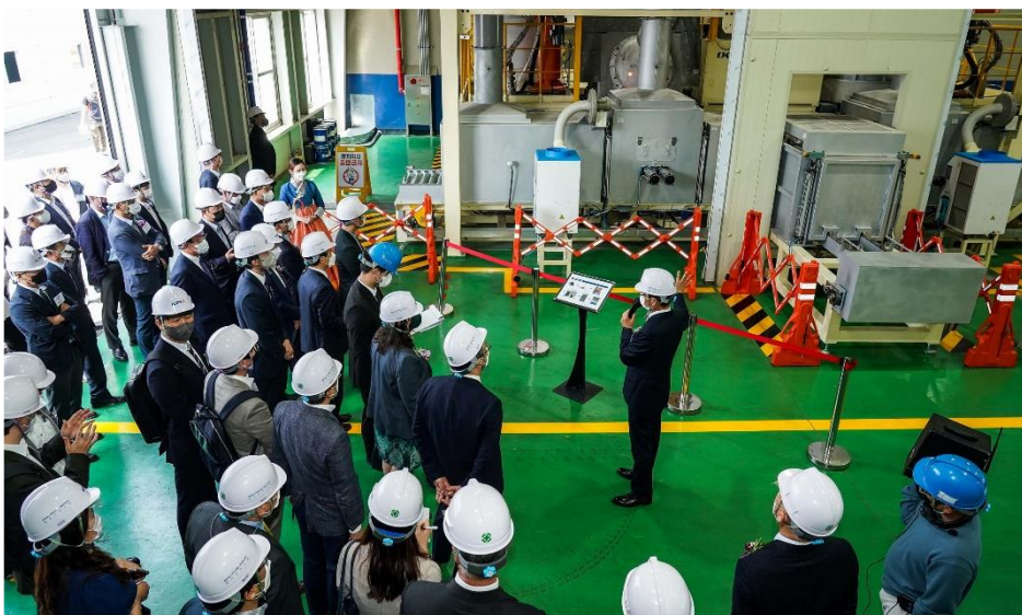
Guests tour plant facilities - official opening of the Korean Metals Plant