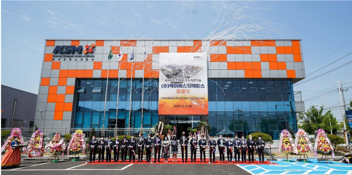
Ribbon cutting ceremony - official opening of the Korean Metals Plant