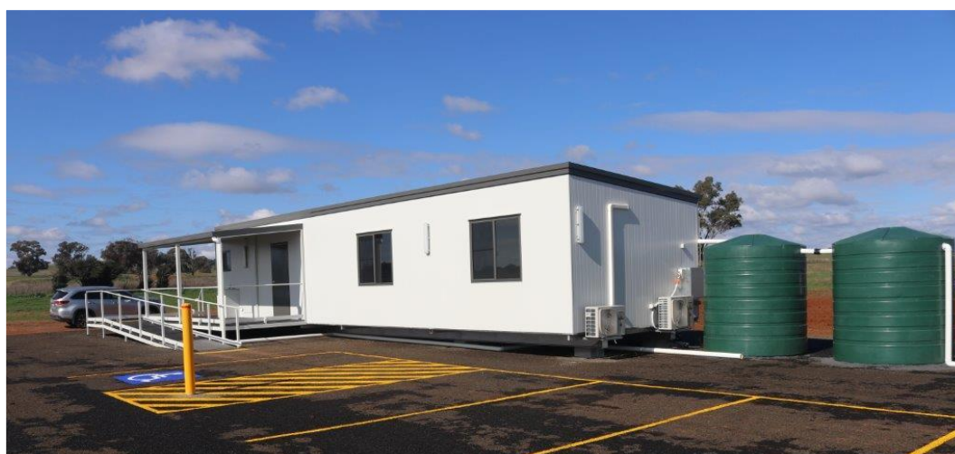
Dubbo Project site office

Construction of the Dubbo Project's onsite office, which commenced earlier in the year, was completed this quarter, and an Occupation Certificate received.