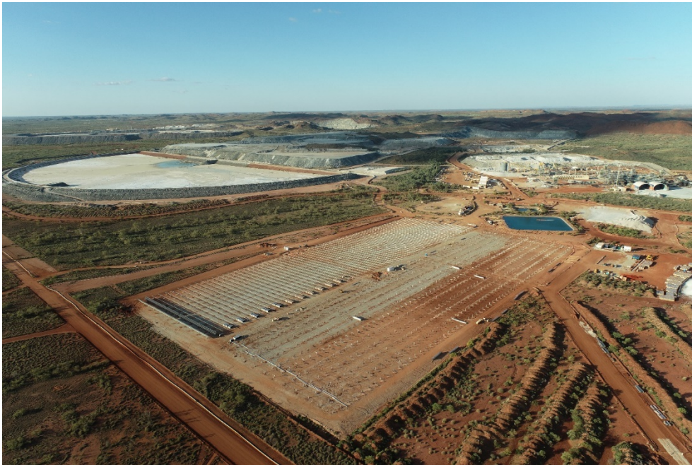
Above: Aerial view of 6MW solar farm under construction.