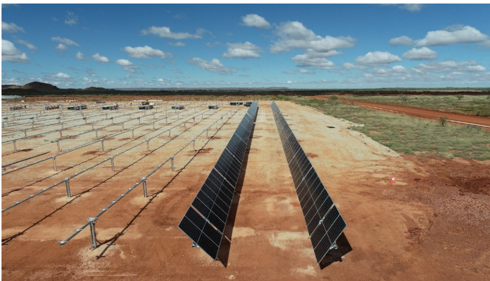
Above: 6MW solar farm under construction.