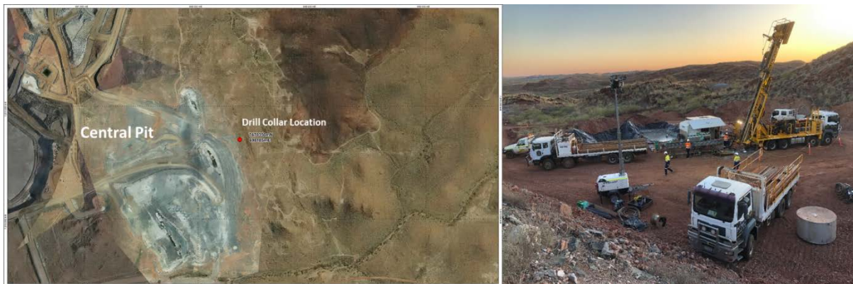
Figure 2: Drill collar location and diamond rig at Central Pit

A systematic grid-based surface sampling program has been designed and scheduled to commence over the southern extension of the Pilgangoora project area in the September 2022 Quarter. The area overlies prospective geology that has yet to be drill tested.