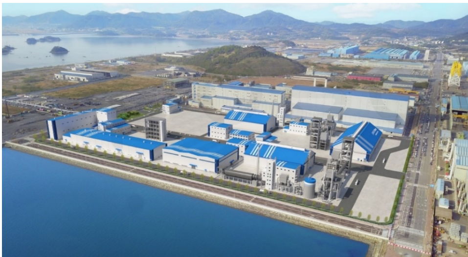
Above: Proposed 43ktpa LHM Lithium Hydroxide Chemical Facility in Gwangyang, South Korea.

Pilbara Minerals' initial 18% equity participation in the JV was funded from the $79.6M 5-year Convertible Bond provided by POSCO, which was drawn down at the time the JV was formed.