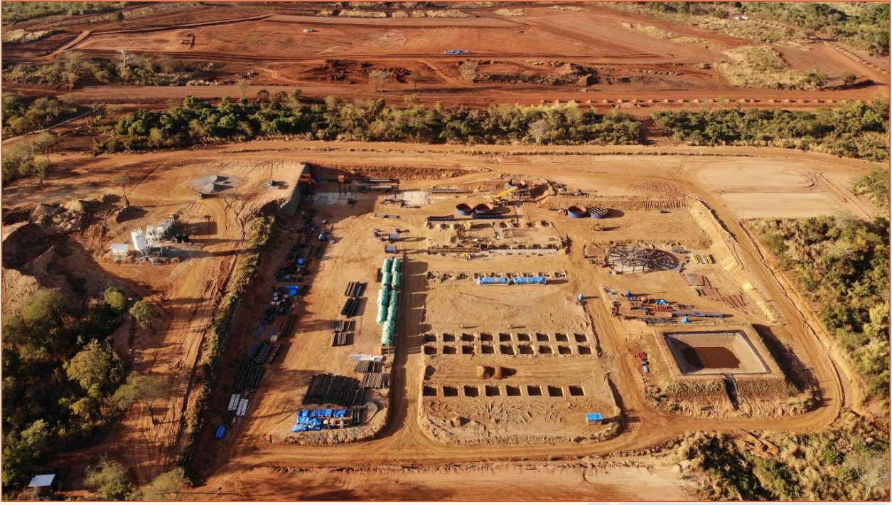
Figure 4: End of June 2022, view from the south of the processing plant area with the TSF in the background. Development of foundations for the drying, screening and packaging building can be seen in the foreground.