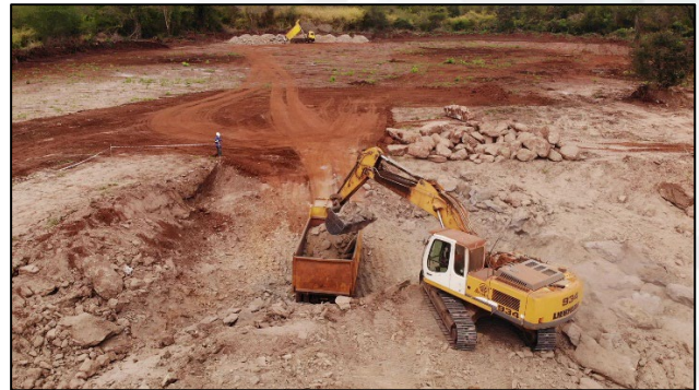
Figure 5: First blast at the starter pit (left) and loading and hauling (right). Note the high-grade graphite stockpile in the background.

The Tanzanian Electrical Supply Company (TANESCO) has completed the installation of the 33kV powerline to site. Once the transformer has been installed, grid power will be readily available to support completion of the construction activities (see announcement 16 June 2022). Initially, this line will supply power to the mining camp and ancillary facilities.