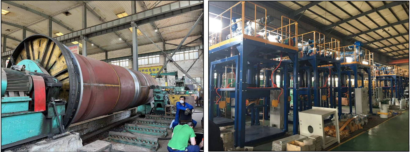
Figure 2: Manufacturing of the Rotary drier (left) and the concentrate bagging equipment (right).