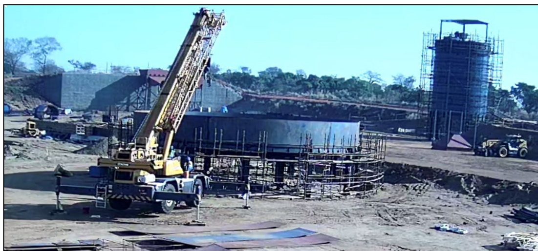
Figure 1: Construction at the Lindi Jumbo Mine. The thickener is in the foreground with the fine-ore bin in the background.

The delay in the debt drawdown and the subsequent cancellation of further shipments will have a negative effect on the completion date of the project, notwithstanding the fact that preparation and construction activities continue on site as well as in China. The market will be updated on the revised projection to start plant commissioning once the Company has more clarity on the commencement of the shipments out of China and Australia.