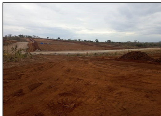
Figure 3: Construction of the TSF wall rockfill.