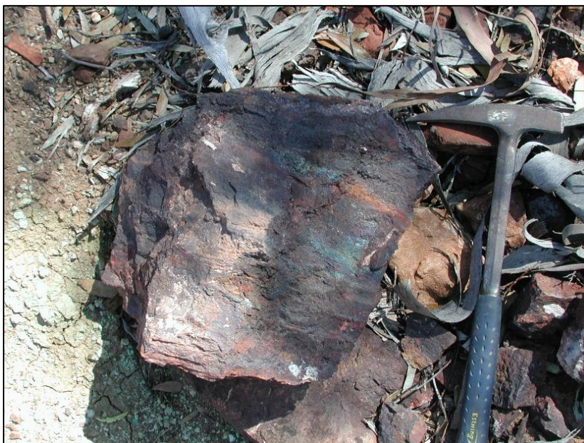
Figure 3. Photograph of a rock specimen from the Halls Knoll Gossan

Two high-grade gossans (Halls Knoll and Dundas gossans) are situated south along strike, however the primary source of this mineralisation is yet to be defined. The Halls Knoll gossan grades up to 20.8g/t Pd+Pt, 8.2% Cu and 1.6% Ni (Figure 3).