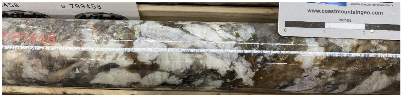
Figure 1: Close up of MF22-116 at 76 to 76.2m downhole. Significant white-grey large spodumene laths

The 2018 drilling program was unable to demonstrate the continuity of significant intercepts, however, MF22-116 has proven that these zones continue along strike to the east.