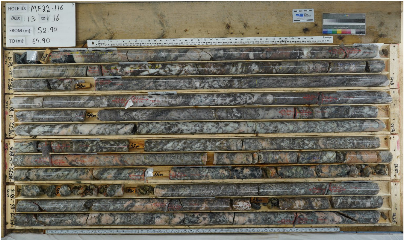
Figure 3: Significant zone of spodumene-bearing pegmatite from MF22-116 from 53 to 77.1m downhole