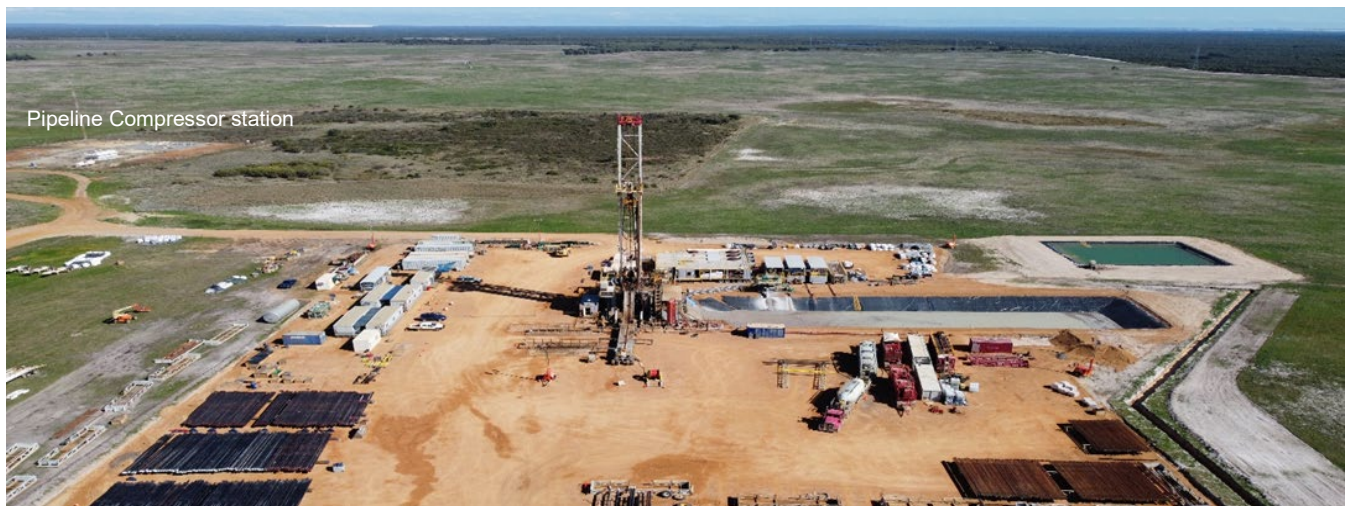
Image 1. Walyering-6 Drill Site, relative to Parmelia Gas Pipeline

To meet current milestones for commissioning gas, (advised by Strike to be end of CY22) Strike has been undertaking a strategy for the early procurement of long lead items, local fabrication and off-site testing of components of the process facility where possible.