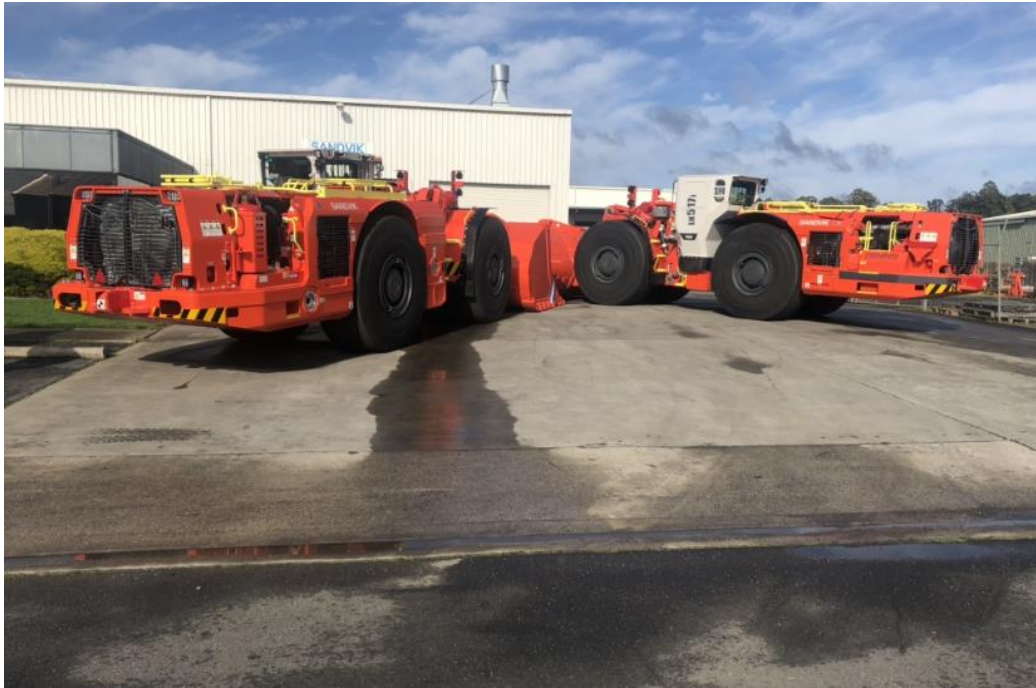
Figure 2. Underground mine loaders

Two new Sandvik underground mine loaders have arrived in Tasmania and are presently being configured with teleremote technology to enable safe underground loading. The loaders are expected to arrive on site later in August which will allow for the commencement of production from stopes and the commencement of 24 hour/7 day operational rosters.