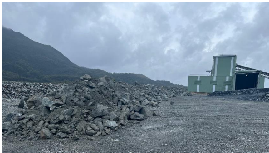
Figure 1. Commissioning feed stockpiled on the ROM pad adjacent to the crusher.

Around 18,000 tonnes of ore has been stockpiled on the run-of-mine pad to date including plant commissioning feed.