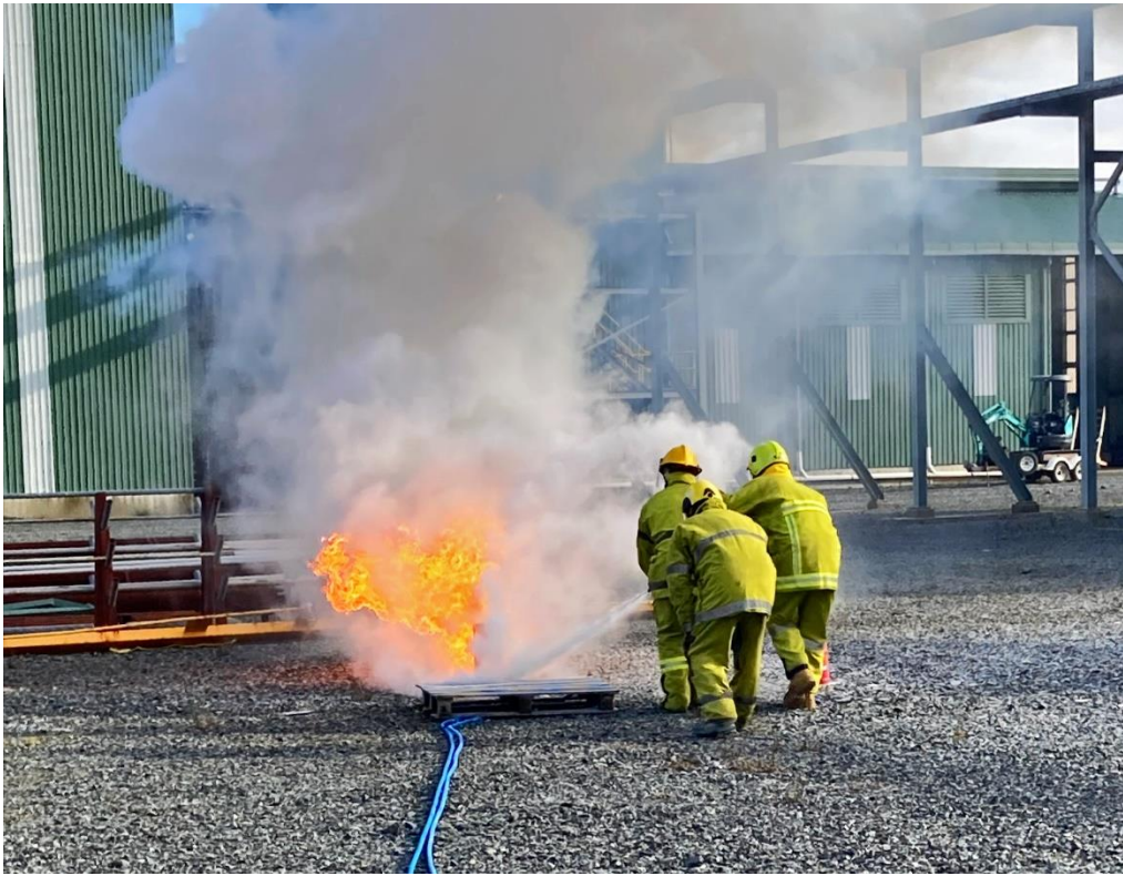
Figure 4. Emergency response team fire training

A safety conscious culture is well established at Avebury. The emergency response team has undertaken training programs to enhance operational readiness and ensure operations at Avebury continue to prioritise safety.