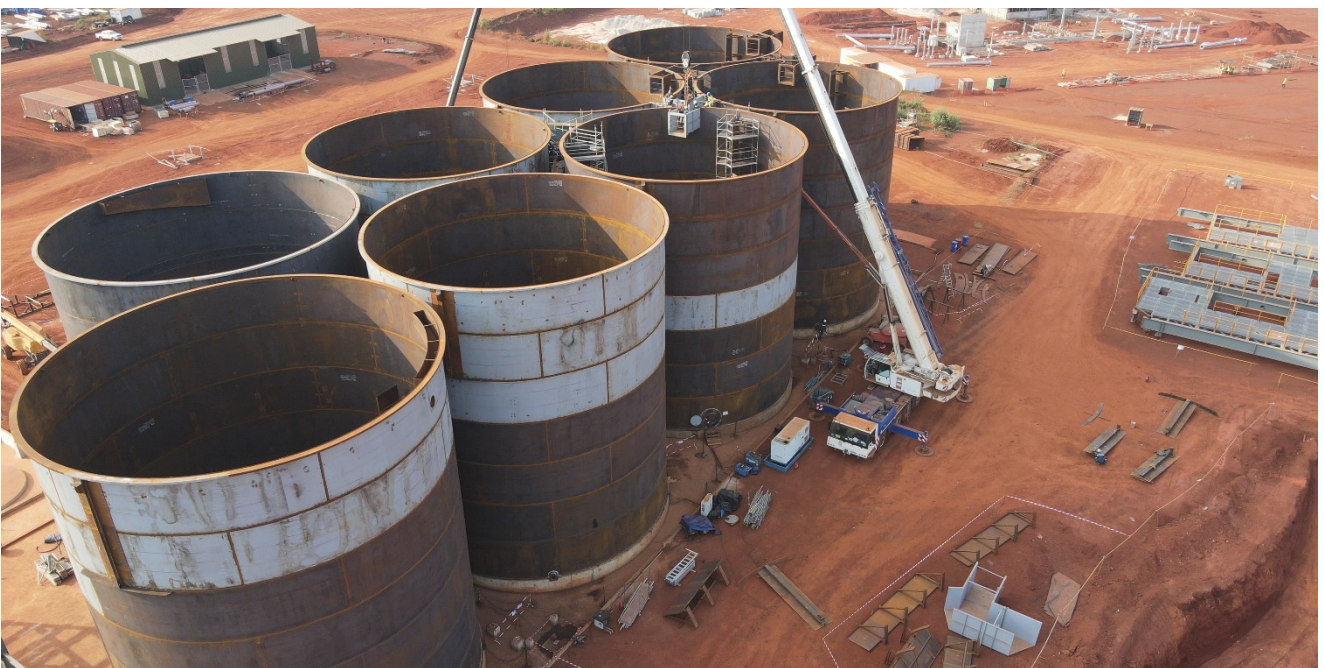
Figure 3: CIL tank construction