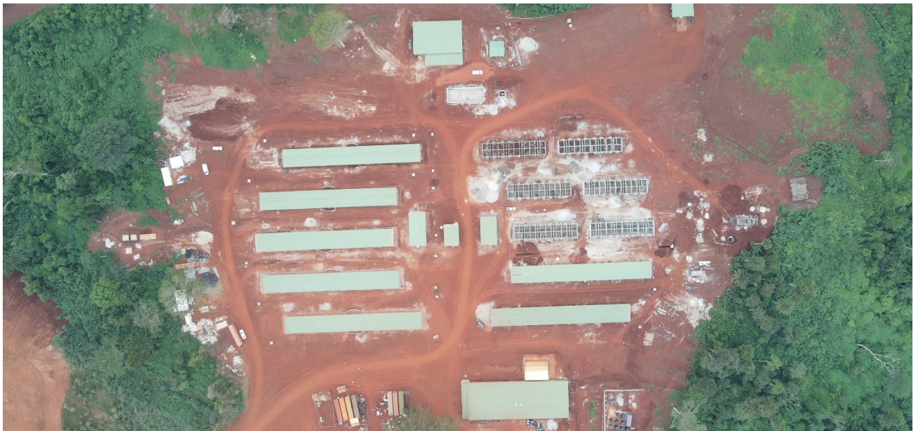
Figure 7: Overview of accommodation rooms and cafeteria