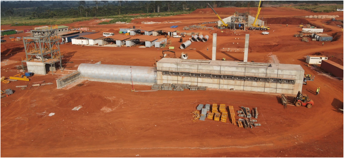
Figure 6: Reclaim chamber