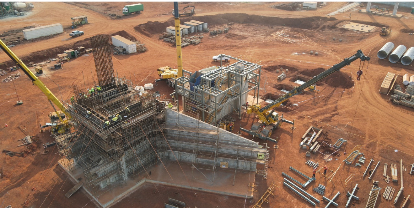
Figure 5: Crusher