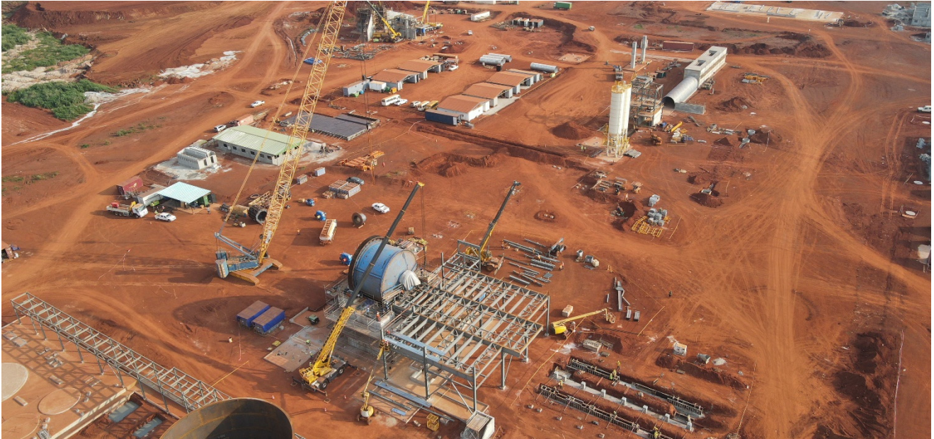
Figure 4: Overview of SAG mill, A-Frame and Lime silos