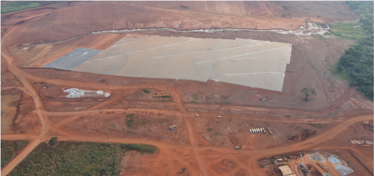
Figure 8: TSF - HDPE lining