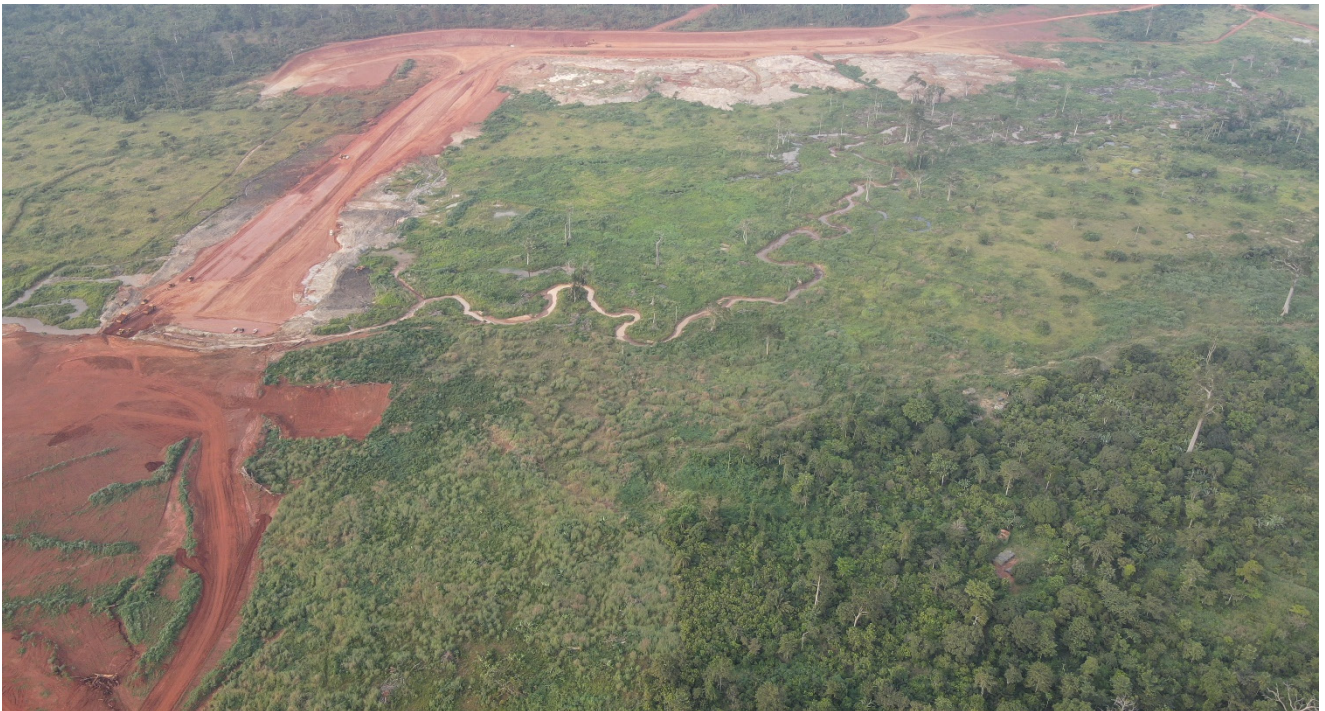
Figure 9: Water dam and diversion channel works