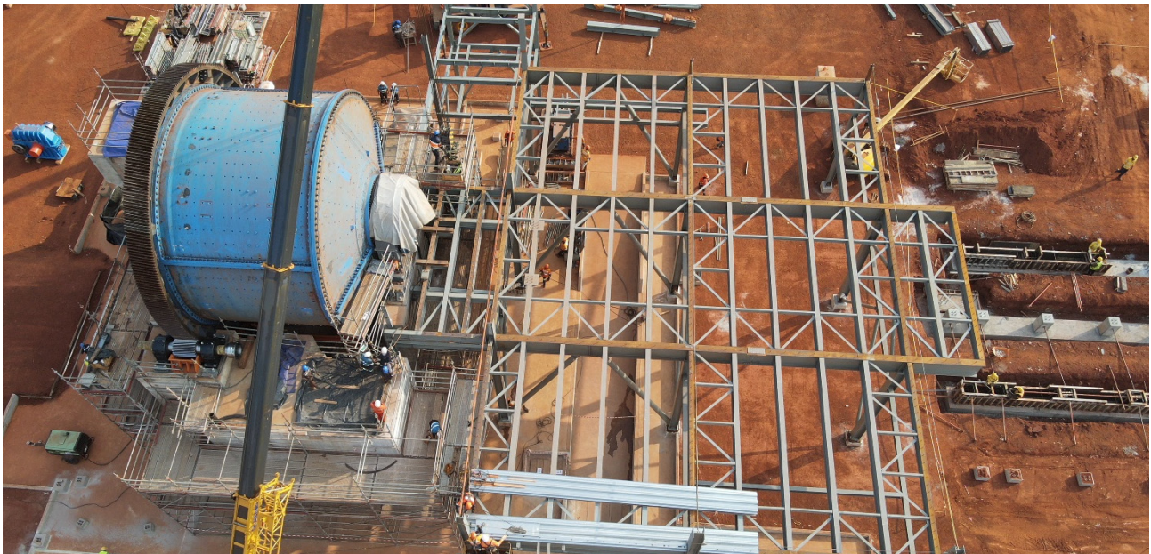
Figure 2: SAG mill installation

Construction continues to track well against schedule, with CIL tank erection and SAG mill installation progressing to plan. Abujar's SMP contractor has ramped up steel erection activities on site. In addition, the camp is more than 70% operational and scheduled for completion in August. Work on the tailings storage facility (TSF) and diversion channel is moving ahead. The following figures show the progress achieved on site during July 2022.