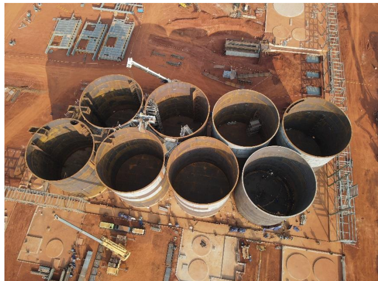
Figure 1: Overview showing construction status of Abujar's SAG mill and CIL tanks as at 13 August 2022