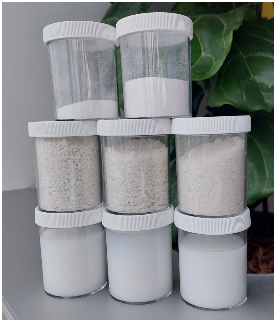
Figure 1: Samples from the micro-plant taken at different stages of the process, with final HPA top right

Upon receipt of assays, any adjustments to the purification steps that may be required will take place at the Company's recently secured larger facility in Perth, Western Australia. The industrial facility will house both the HiPurA ® HPA micro-plant and the HiPurA ® HPA pilot plant, providing significant operational synergies. The purified solution from the pilot plant will be used as a feed to the micro-plant which will be repurposed to produce a range of 5N, or higher, products. Samples as produced from the Company's HiPurA ® HPA micro-plant are shown below, in Figure 1.