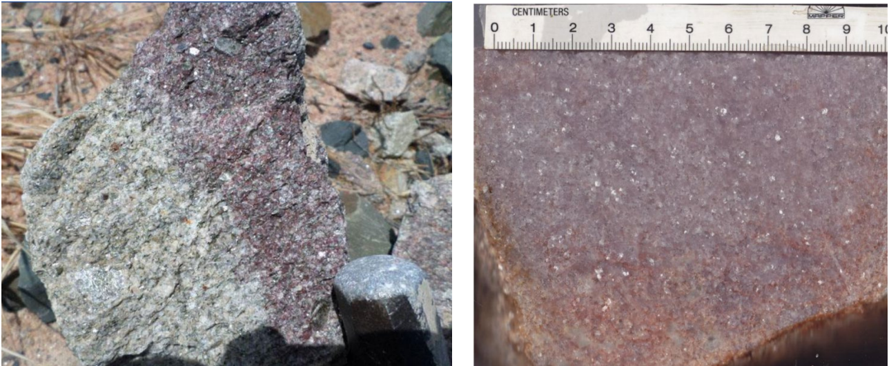
Figure 2. (Left) Sample of red/pink-altered contact with the Blackman Gap granite described as lepidolite 2 (Right) Sample described as lepidolite-rich pegmatite that assayed 3.55% Li 2 O 1

Metalicity regards the Mt Surprise Project as prospective for lithium mineralisation and that the granites in the area are clearly fertile to produce LCT (Lithium-Caesium-Tantalum) pegmatites. Other lithium deposit styles such as rhyolite hosted deposits are also prospective given the Mt Surprise area contains similar host rocks within a volcanic caldera setting to the Rhyolite Ridge lithium deposit in USA.