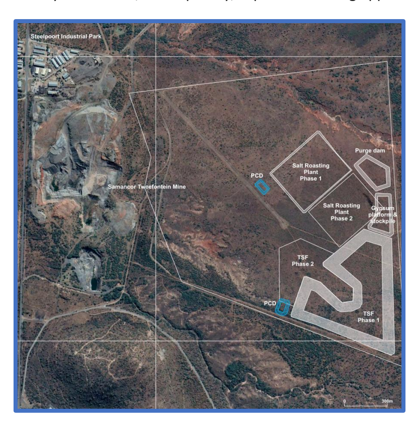
Figure 2: Google Earth image of SRL site in relation to local infrastructure.

Kadoma and its holding company (Freedom Property Fund), also plans to develop a utility scale PV Plant next to the SRL Site to provide green energy to the surrounding mines and the SRL Site. The PV plant is expected to be constructed in a modular fashion with uniquely designed fixed-tilt ground mount structures and will be commissioned in modules of 2 Mega Watt peak (MWp) each. Together with the prospect of recovery of water and the provision of green energy, the SRL Site is expected to gain developmental sustainability credits and, consequently, expanded funding opportunities.