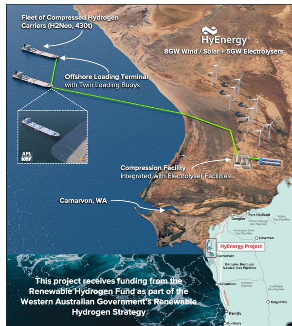
Figure 1: Overview of the HyExport Study export utilising offshore loading. Site locations are conceptual only.

Notice: This Project receives funding from the Renewable Hydrogen Fund as part of the Western Australian Government's Renewable Hydrogen Strategy. For further information visit www.wa.gov.au/renewablehydrogen