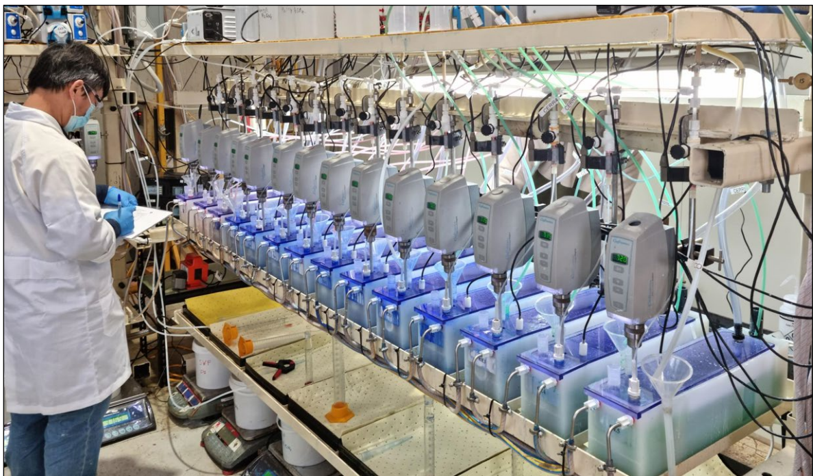
Figure 1: Cobalt solvent extraction

Blackstone Minerals Limited (“Blackstone” or the “Company”) is pleased to provide an update on our ongoing metallurgical test work programmes for both the Ta Khoa Nickel Project (“TKN” or “Upstream Project”) and the Ta Khoa Refinery Project (“TKR” or “Downstream Project”) during their respective Definitive Feasibility Study (“DFS”) phases.