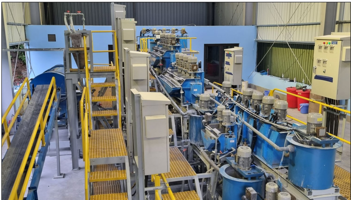
Figure 3: TKN Pilot Plant located at the mine site