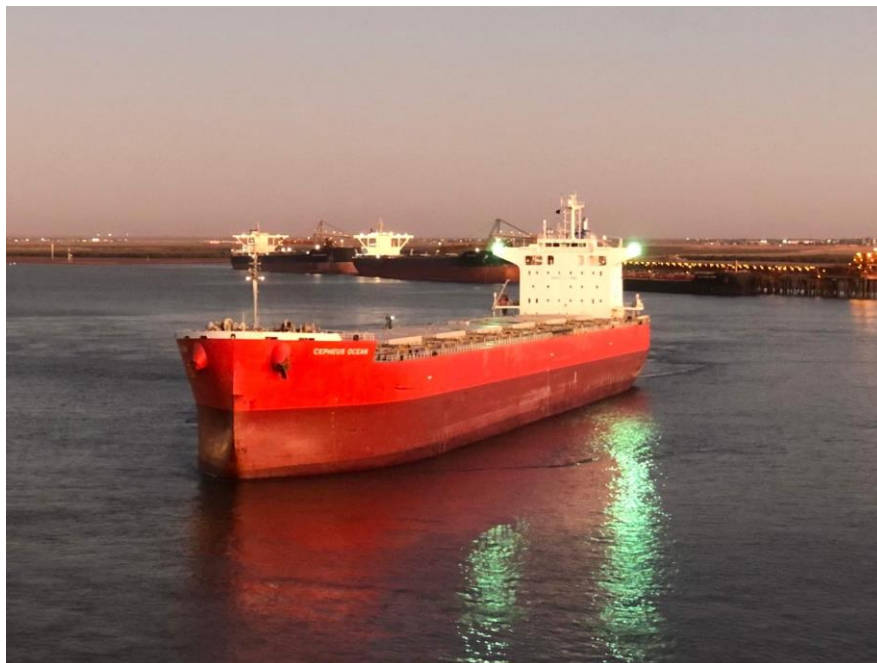
Figure 1: MV Cepheus Ocean preparing to dock at Utah Point

Strike Resources Limited (ASX:SRK) ( Strike ) is pleased to confirm that MV Cepheus Ocean sailed out of the Utah Point Multi-User Bulk Handling Facility ( Utah Point ) at Port Hedland on 29 August 2022, carrying 66,618 tonnes of lump direct shipping iron ore ( DSO ) sourced from Strike's Paulsens East Iron Ore Mine ( Paulsens East ) in the Pilbara region of Western Australia, bound for a steel mill customer in China.