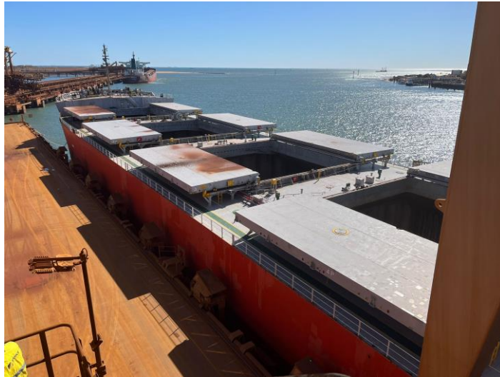
Figure 2: MV Cepheus Ocean docked at Utah Point, ready for loading