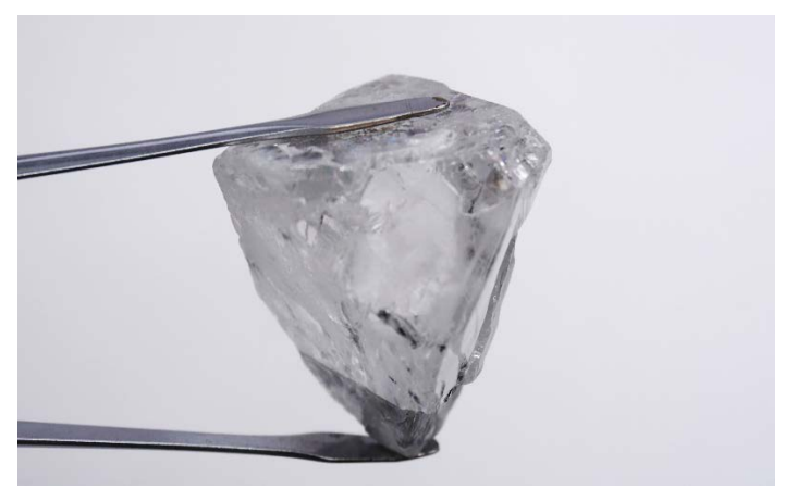
160 carat white Type IIa diamond recovered by SML at Lulo

The 160 carat diamond is the 28<sup>th</sup> +100 carat diamond recovered at Lulo and was mined from the same alluvial mining block as the "Lulo Rose", the 170 carat pink coloured diamond recovered in July 2022 (refer ASX announcement 27 July 2022). The 160 carat diamond is the 6<sup>th</sup> largest recovered at Lulo to date.