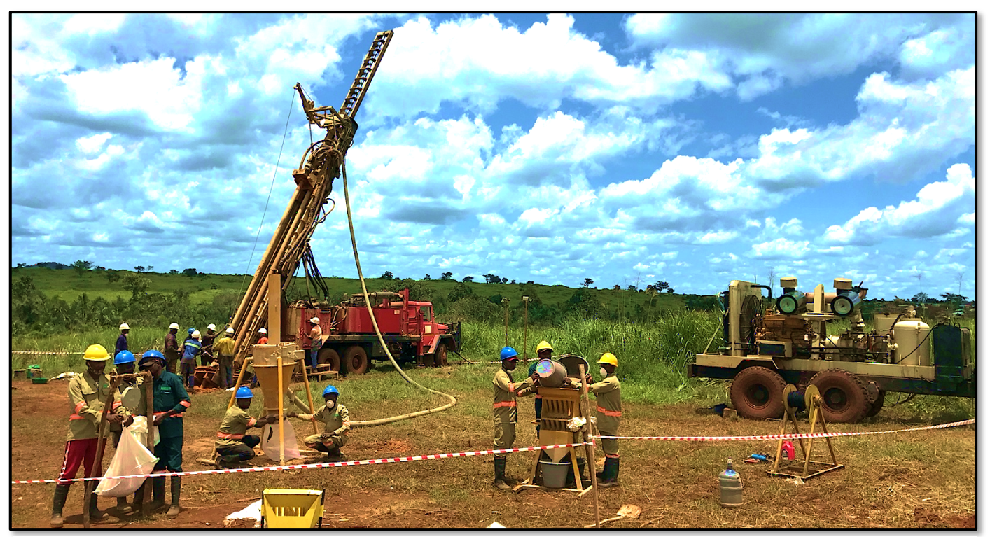
Figure 1 - RC Rig and Drill Crew at Kebigada South-East

Following completion of the Kebigada South-East program will move to the Congo Ya Sika prospect.