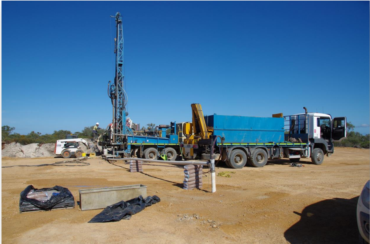
Figure 2: Water Bore Rig onsite