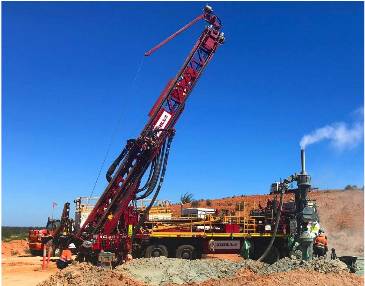
Figure 1. Showing the K-Drill RC rig that will perform the infill drilling at the Manna Lithium Project

“K-Drill is a highly experienced drilling contractor and we are confident they will be a valued addition to the Manna Lithium Project. We look forward to updating the market and shareholders of progress at Manna during drilling and as further results from this program become available.”