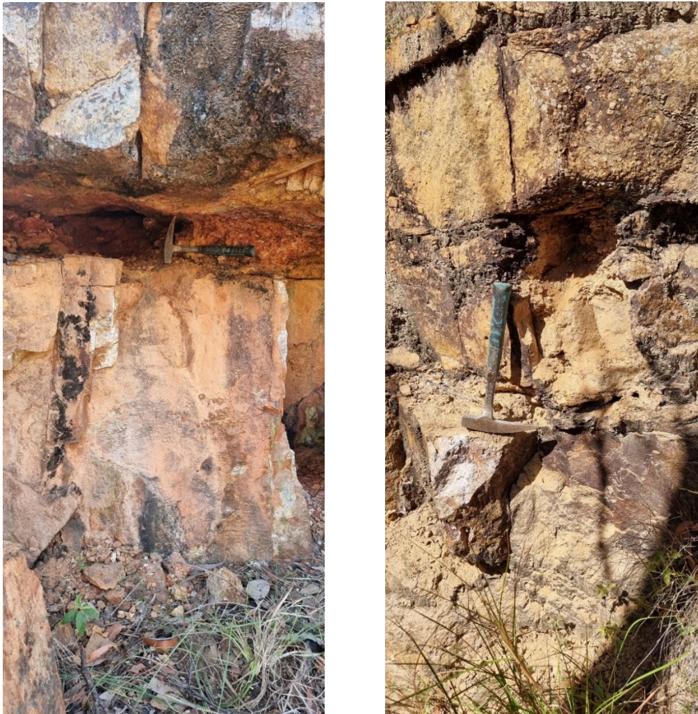
Figure 4 – Flat-lying stacked greisen zones in granite at Gows.

Sixteen samples (KRC000266 – 281) were collected from workings at Gows on both sides of the creek that bisects the prospect. Most of the mines do not extend for considerable extent into the hillsides or at depth. The samples were mainly collected to determine the grade of the flat-lying greisen lenses. Two samples (KRC000266 and 267) returned elevated tungsten values of 1.0% and 0.34% . Other elevated values include copper to 0.50%, lead to 0.503%, and indium to 31.3ppm . The multielement nature of mineralisation at Gows is shown by results of 271ppm Ag, 4980ppm Cu, 3430ppm Pb and 31.3ppm In. There has been no previous drilling at Gows. Further detailed mapping and sampling of the greater Gows area will be undertaken to determine the extent of mineralisation and allow for possible drill planning.