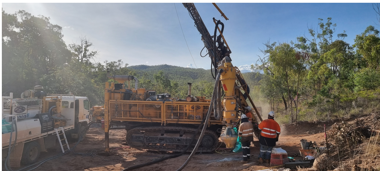
Figure 1 – RC drilling at Adelaide Prospect

Sample results have been received for EVR’s initial campaign of reverse circulation (RC) drilling completed at the Boulder area. Excellent results at shallow depths were returned from several areas. Intersections are summarised in Table 2. The tin mineralisation style targeted in the Boulder area is granite-greisen-hosted bulk-tonnage zones that are generally lower grade than the structurally controlled quartz vein-hosted targets found in areas such as Stannary Hills.