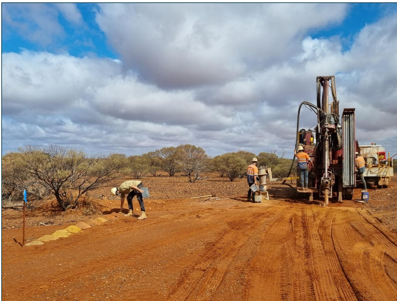
FIGURE 1: AC DRILLING EAST OF IRONBARK