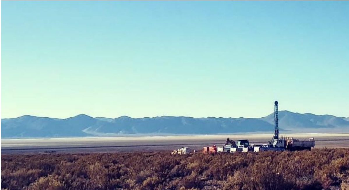
Figure 1: Drilling rig at Solaroz Project (Mario Angel Concession), borehole OZDH001

Drilling has commenced at borehole OZDH001 within the Mario Angel concession (refer Figure 2) at Solaroz.