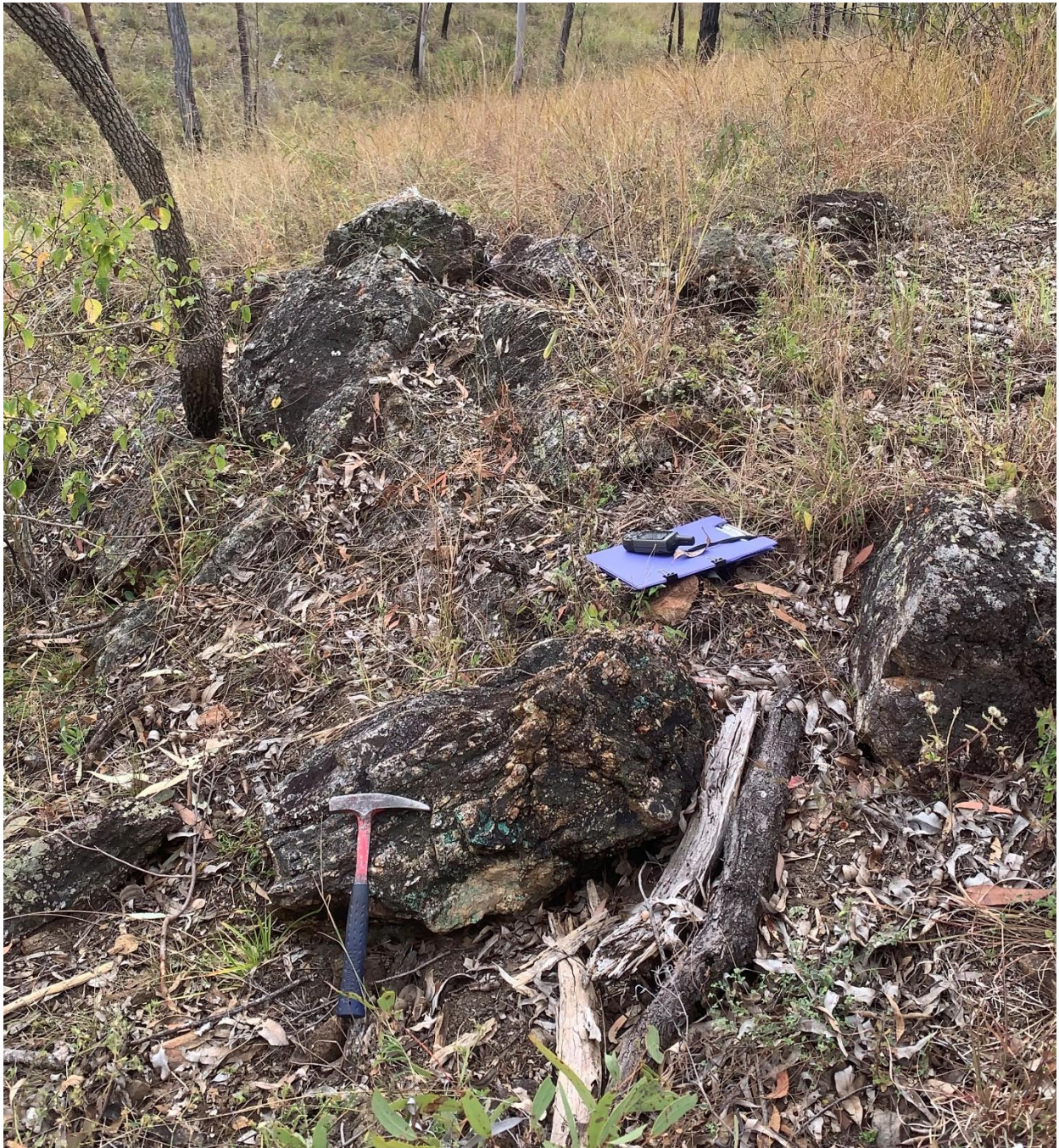
Figure 1 Outcropping Zone 4 Mineralisation (sheared-brecciated quartz veined, gossanous fragmental volcanoclastic with malachite staining)

Note: outcrop has been sampled and assay results are pending