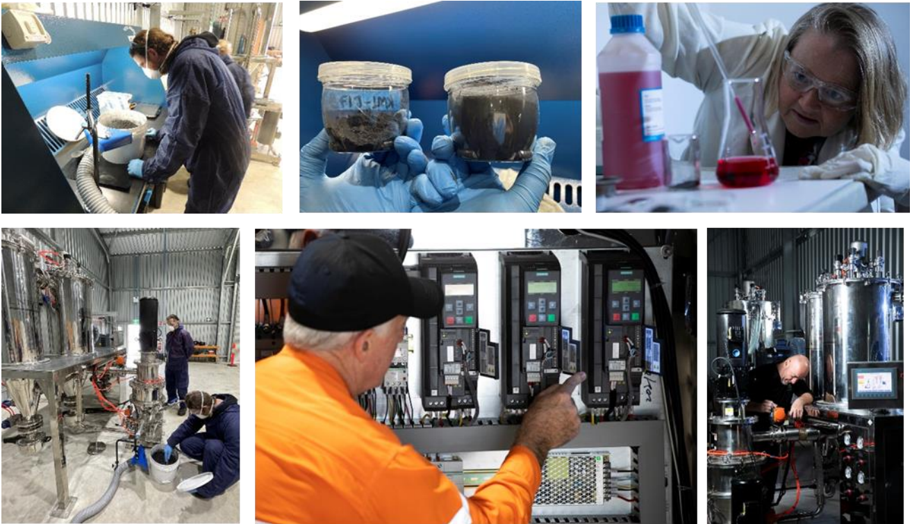
Figure 1: Commissioning of pilot facilities, Collie

International Graphite will continue operating the Collie pilot facilities to refine operating systems and material handling capability, implement comprehensive quality control and quality assurance scalable to commercial operations, develop intellectual property including patents and trademarks, health, safety and environmental management systems, and develop cost models.