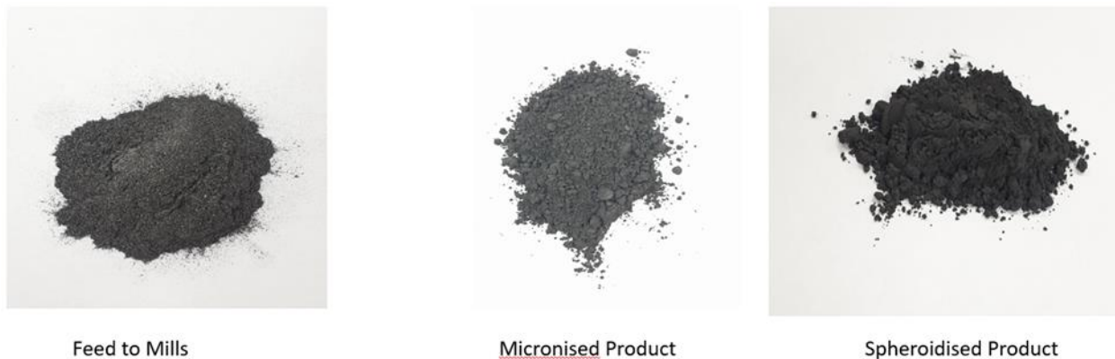
Figure 1 – Feed and products from the pilot plant

Samples of the feed, micronized product and spheroidised product from the pilot plant run are shown in Figure 1.