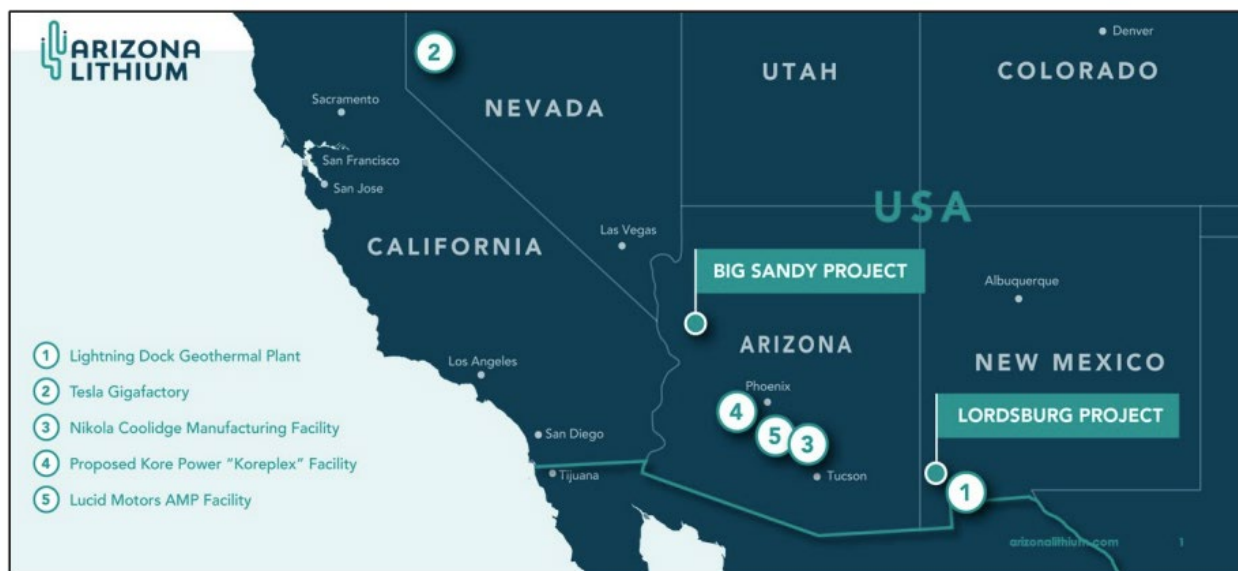
Figure 1 - Arizona Lithium Portfolio, including major Li-battery infrastructure in close proximity to Big Sandy and Lordsburg Lithium Projects

The Permit of Exploration (POE) that includes 145 exploration holes and a bulk sample at the Company's Big Sandy Lithium project in Arizona is awaiting BLM approval. Community involvement is welcomed to ensure mutually beneficial outcomes for all stakeholders and the Company is very confident that a drilling program can be completed without environmental impact and to the satisfaction of all stakeholders.