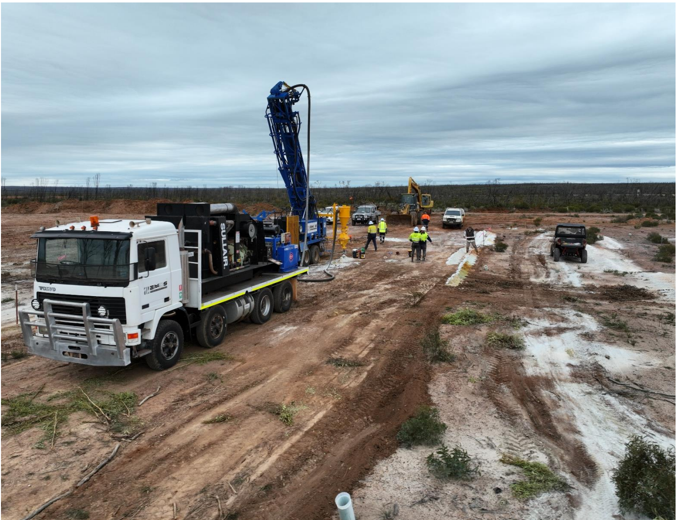
Figure 2: Infill RC Drilling at Kat Gap

The RC drilling program was suspended again late last week due to severe weather conditions experienced on-site. Drilling should be underway again in a week or so.