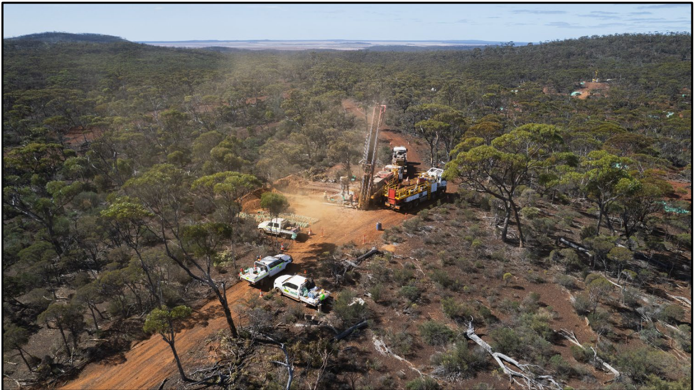
Figure 1 — RC drilling on site at Galileo's 100% owned Callisto discovery near Norseman.

Two rigs (one RC and one diamond drill) are continuing to drill at the Callisto discovery where Galileo recently made a major palladium-platinum-gold-copper-nickel discovery (see ASX announcement dated 11 th May 2022). Subsequent assay results have shown the sulphide mineralisation at Callisto is accompanied by the high value precious metal rhodium (see ASX announcements dated 27 th May 2022 and 4 th August 2022). Rhodium assaying of sulphide zones is progressing with a separate analytical technique used to quantify rhodium after the initial Pd-Pt-Au-Cu-Ni results. The results reported above will ultimately be updated to include rhodium when laboratory assays become available.