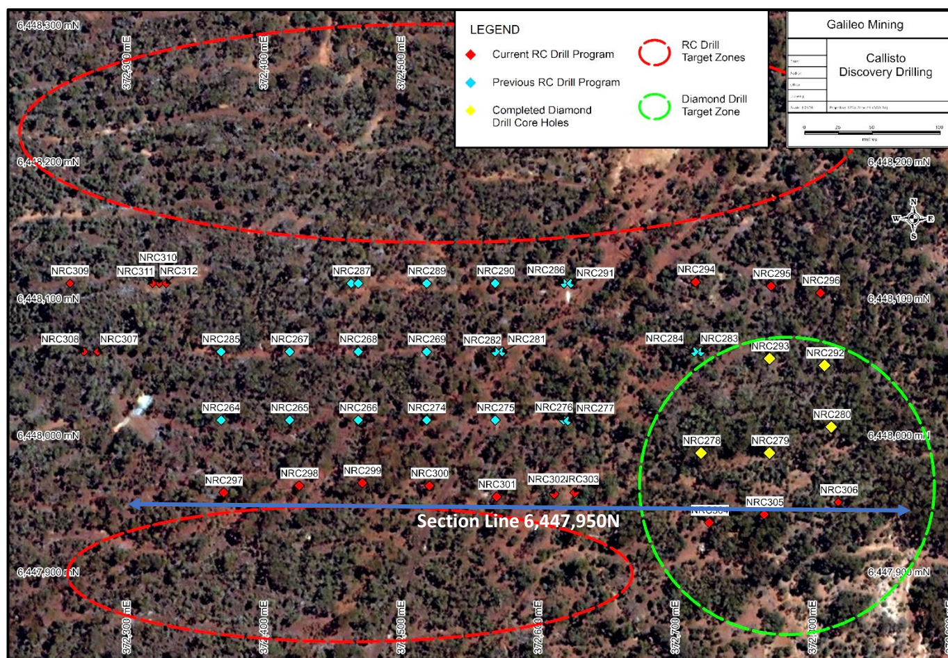
Figure 3 — Plan map of drilling with 6,447,950N section line (Figure 2). RC and diamond drill target zones around known sulphide mineralisation for the current drill campaigns are shown (dotted ellipses). Regional RC drilling up to one kilometre away from existing drill holes (off plan to the north) is also scheduled within the current RC program.

Figure 3 shows a plan view of the drilling undertaken to date for programs conducted earlier in the year and for the current ongoing RC and diamond core drill programs. Appendices 1 and 2 contain the drill hole details for the current assay release.