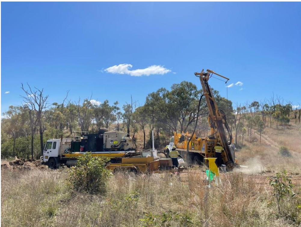
Figure 1. RC Drilling at the Project

Bindi Metals Limited ( ASX: BIM , “ Bindi ” or the “ Company ”) is pleased to announce that its maiden RC drilling program at the Biloela Project has commenced. The Biloela Copper Gold Project ( Project ) is located in the highly prospective New England Belt and is located 40 km west of the Mt Cannindah Project owned by Cannindah Resources (ASX:CAE), which recently recorded world class drill intercepts of 1,022m @ 0.5 % CuEq.