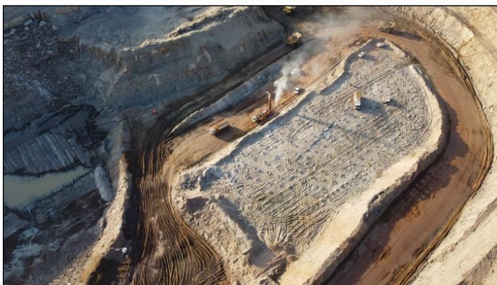
Figure 1. Grade control drilling ore at base of Grants Stage 1

The crushing and screening plant is on track for commissioning ahead of the DSO sale. A nightshift has been implemented to accelerate construction of the Dense Media Separation (DMS) plant which is on track to support spodumene concentrate production in H1 2023.