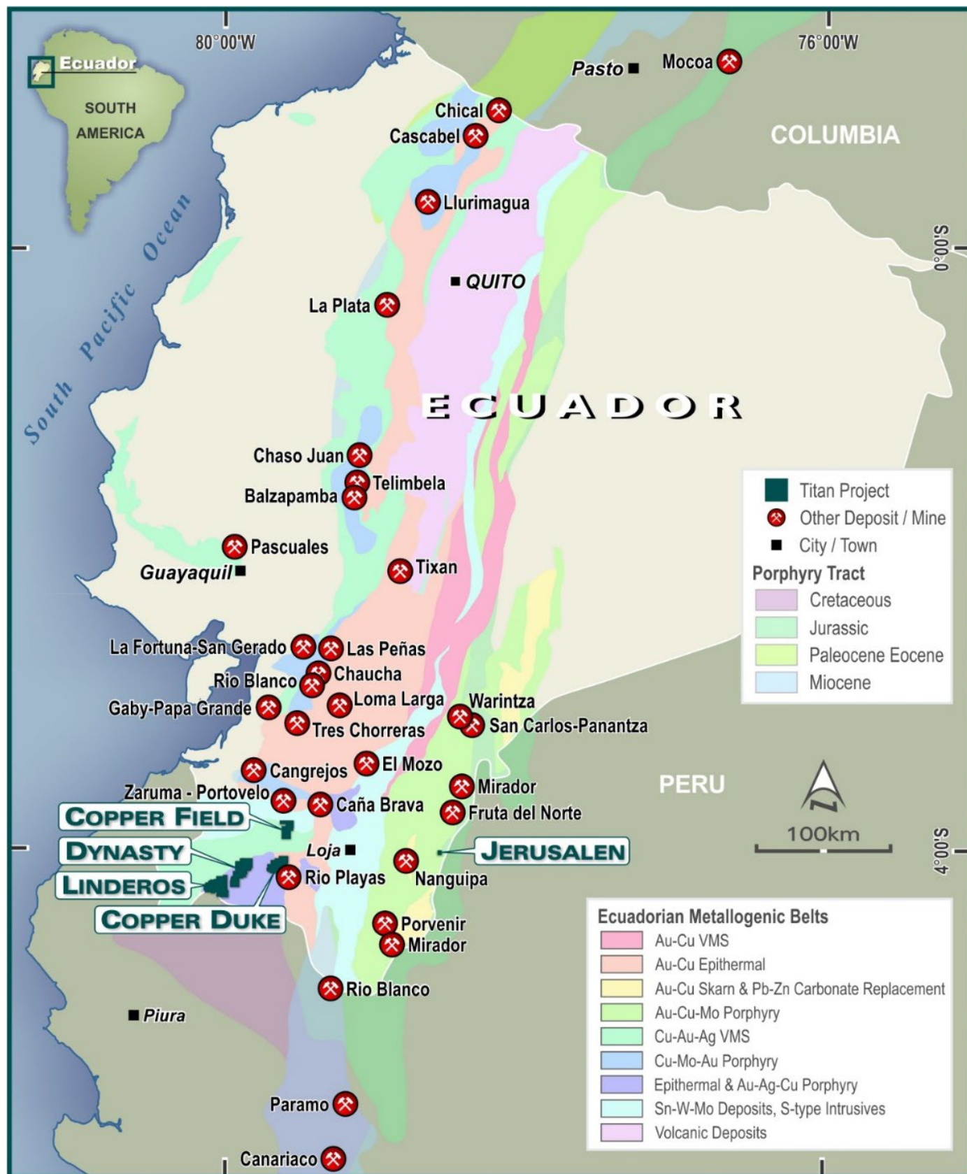
Figure 1: Linderos Project location map in relation to Titan Minerals Southern Ecuador Projects, and the metallogenic belts of Ecuador