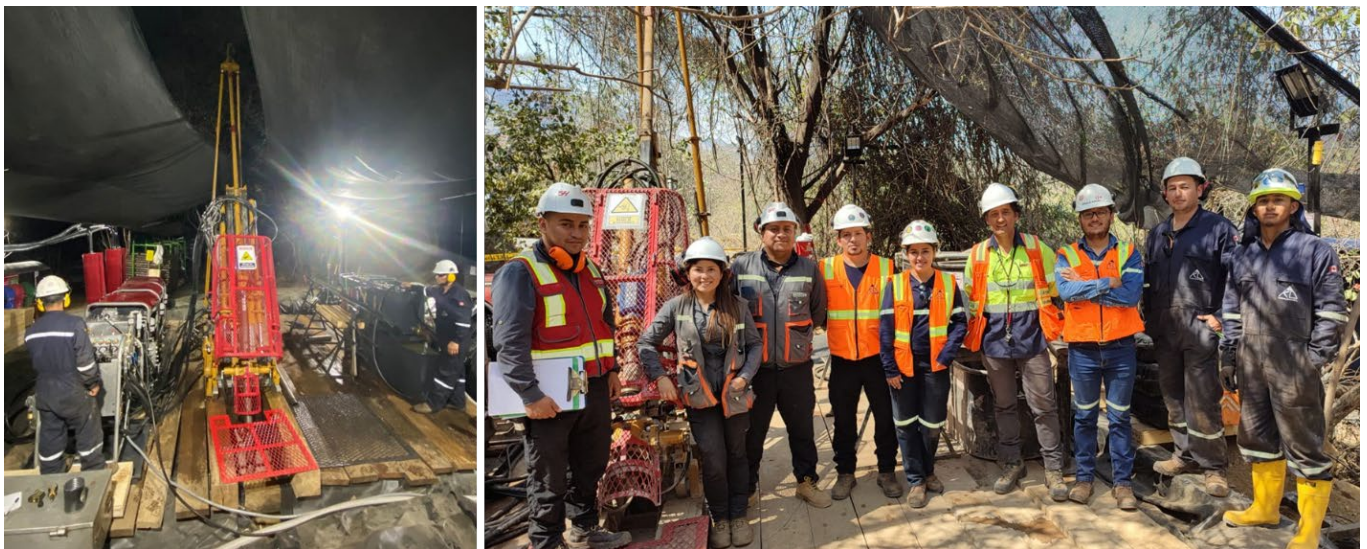
Plate 1. Left: Diamond drilling at Copper Ridge prospect. Right: Titan Geological Team and Drilling Contractors on Site at Meseta Gold prospect.

Quartz vein abundance contours can be used to define the borders of porphyry intrusions, with increasing quartz vein abundance commonly correlating with an increase in chalcopyrite and molybdenite mineralisation, as is typically observed in large-scale porphyry deposits.