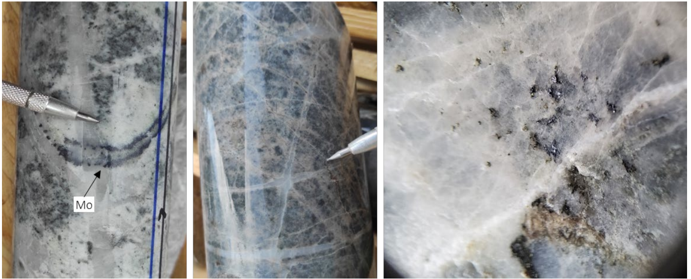
Plate 2. Left: CRDD22-001 (494m) Diorite porphyry with phyllic alteration, 1-2% disseminated chalcopyrite, 2-3% pyrite, 1-2% molybdenite in B-type quartz vein, intensive > 5% quartz veinlet stockwork. Middle: CRDD22-001 (530m) Andesite with potassic alteration, 2-3% disseminated pyrite, trace < 1% chalcopyrite, trace < 1% molybdenite, intensive > 5% quartz veinlet stockwork. Right: CRDD22-002 (94m) Diorite Porphyry with phyllic alteration, 0.5-1% disseminated chalcopyrite, 2-3% pyrite, 0.5-1% molybdenite in B-type veins.