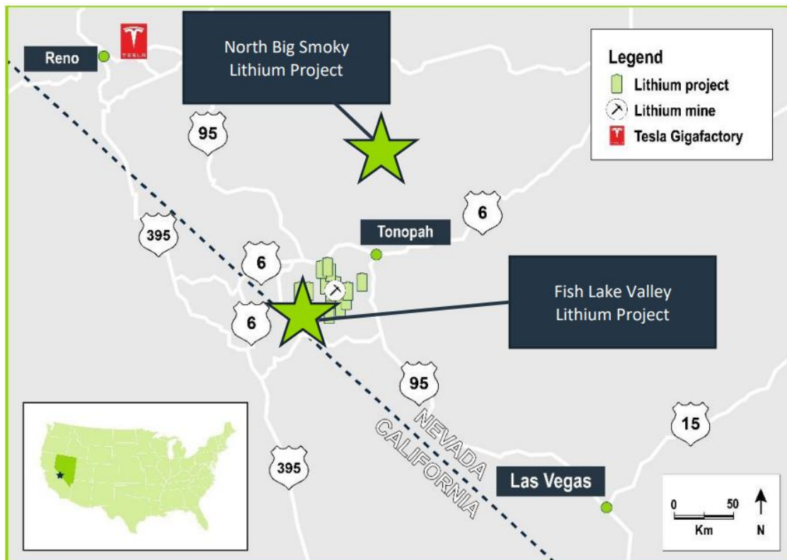
Figure 2 – Morella Nevada Lithium Project Locations.