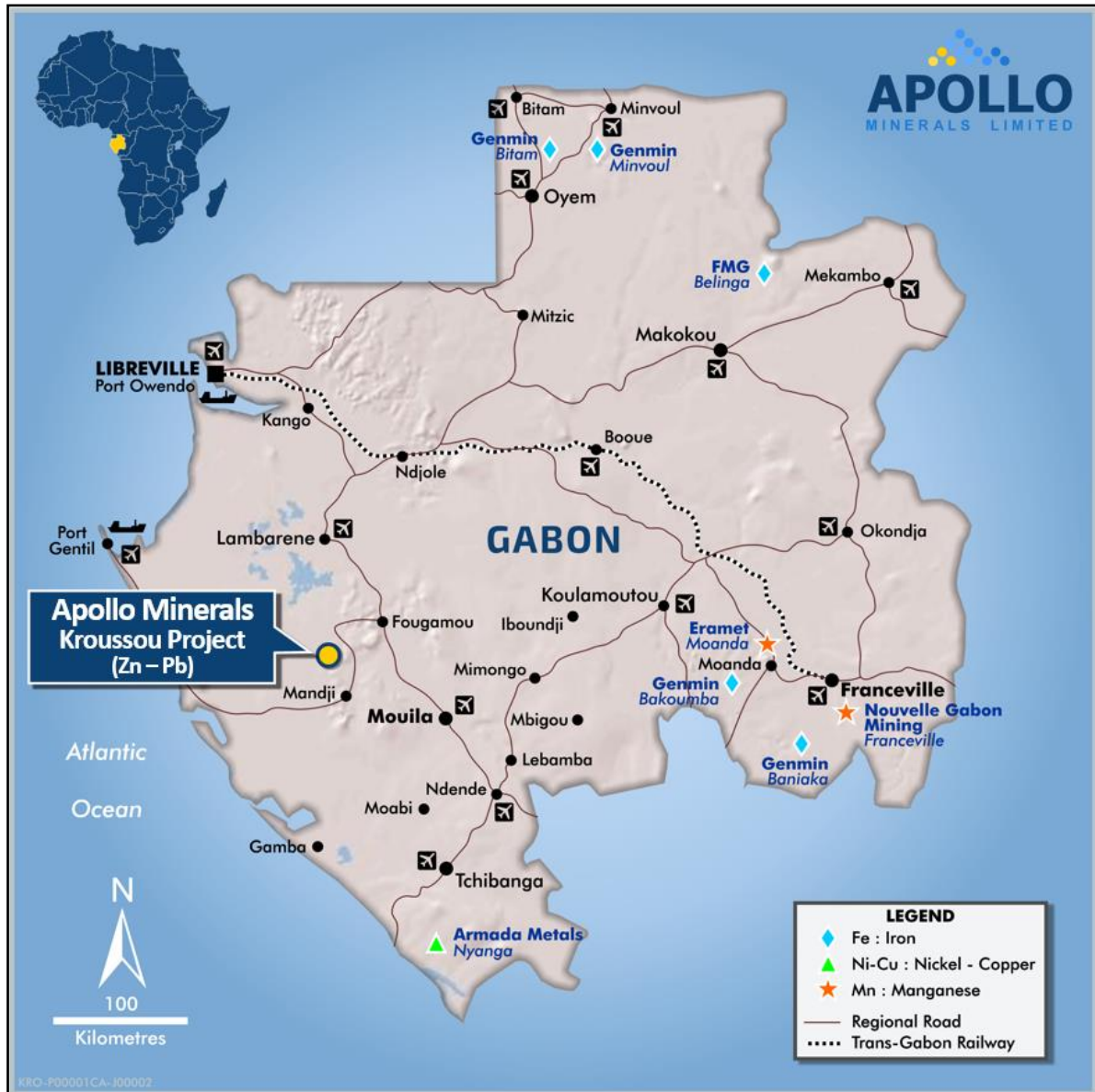
Figure 3: Location of Kroussou in Gabon with regional transport infrastructure.