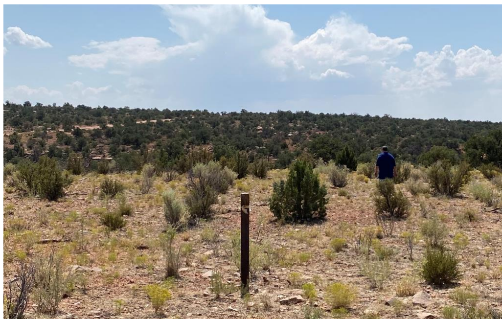
Figure 3: The cleared Mineral Canyon Fed 1-3 well pad, graded gravelled road in background.

The Mineral Canyon well is approximately 50 meters from Canyon Bottom Road, a graded gravelled county road and approximately 300 meters from the existing pipeline corridor. The original drill pad remains visible and can be re-established for the re-entry program (See Figure 3).