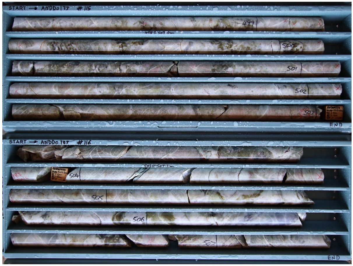
Figure 7: Drill hole ANDD0133 showing intersection of pegmatite from 498.2m - 507.4m

With two pegmatite bodies intersected (see Figure 7 ) that visually contained spodumene and tantalite, laboratory pulp samples from ANDD0133 were re-assayed specifically for lithium and associated elements. Highly anomalous values of lithium (up to 0.41% Li<sub>2</sub>0), caesium (up to 2,240ppm Cs), rubidium (up to 1.43% Rb) and tantalum (up to 2,780ppm Ta) were returned in several samples (Table 2).