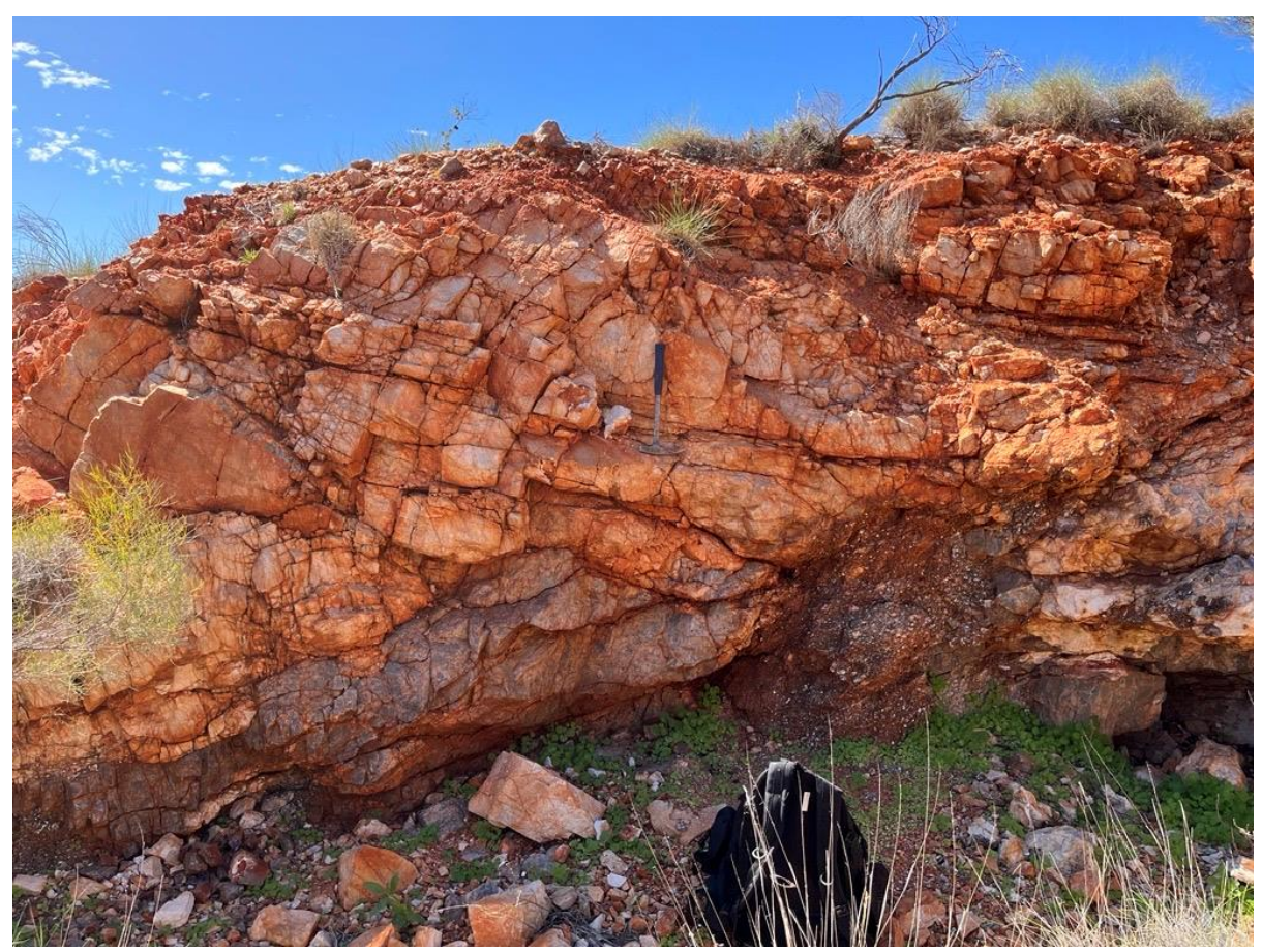
Figure 4: Close-up of pegmatite in historical mine working