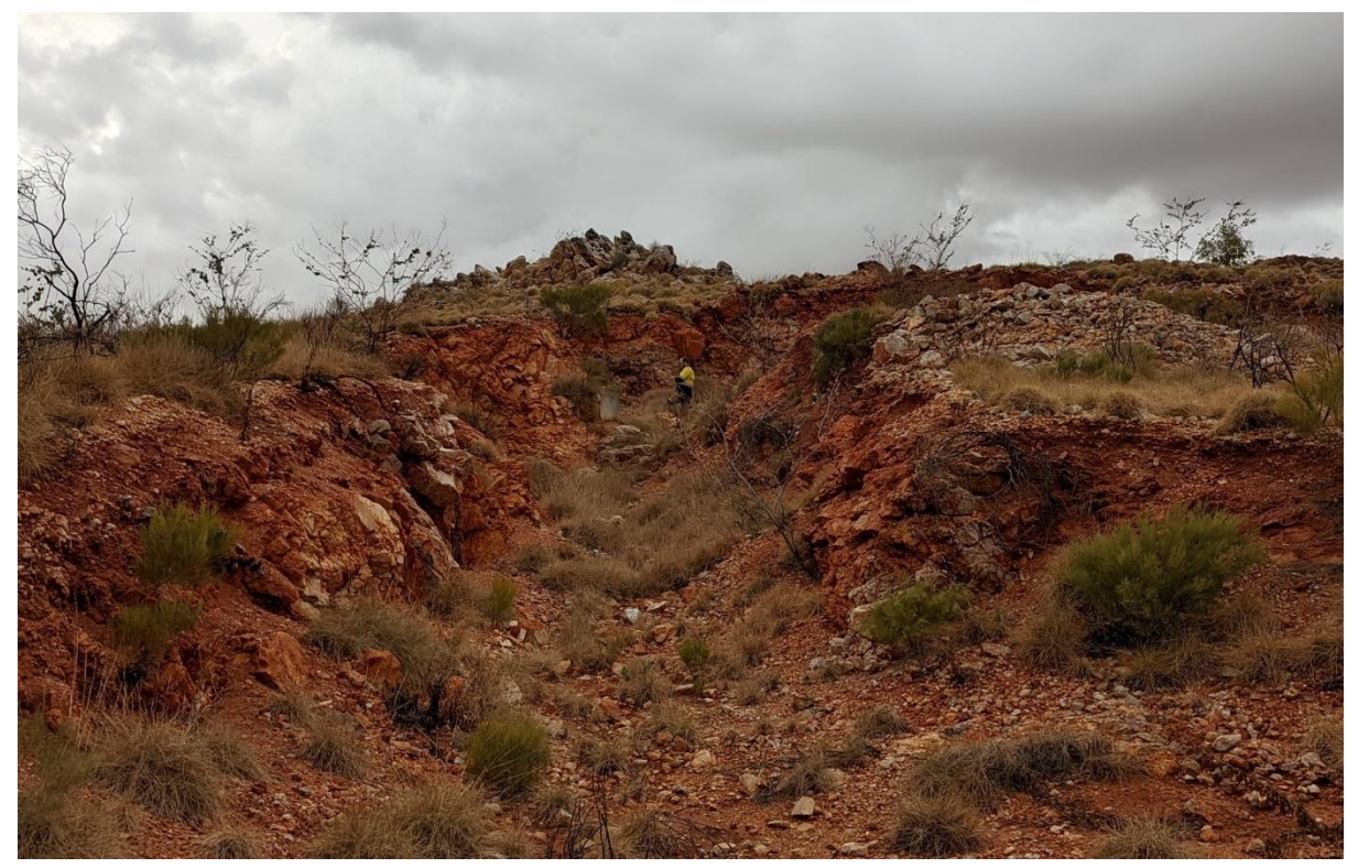
Figure 3: Pegmatite historically mined for beryl, tantalite and cassiterite, located within Azure's Andover Project