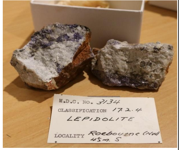
Figure 2: Lepidolite from "4.5 miles south of Roebourne"