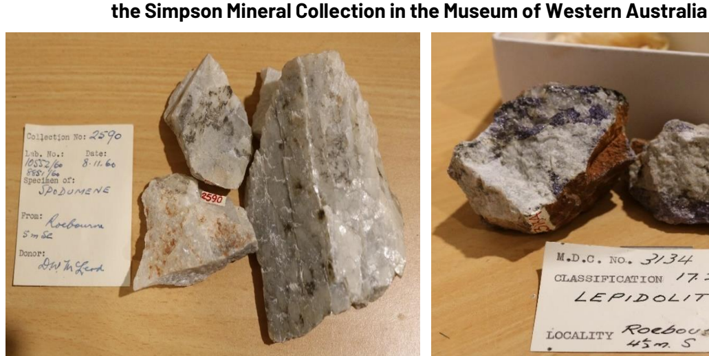
Figure 1: Spodumene from "5 miles southeast of Roebourne"

Pegmatite samples collected in the 1960s from within the Andover Project area and held in