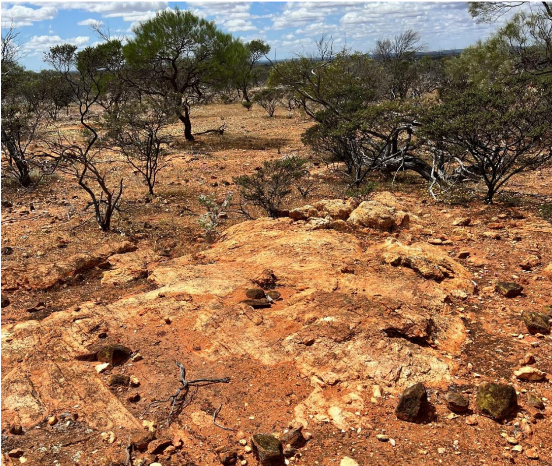
Figure 2: Pegmatite outcrops identified at Yalgoo West Project

Field mapping and surface geochemistry is planned to assess the Tenements for pegmatite-hosted Lithium-Caesium-Tantalum (LCT) mineralization.